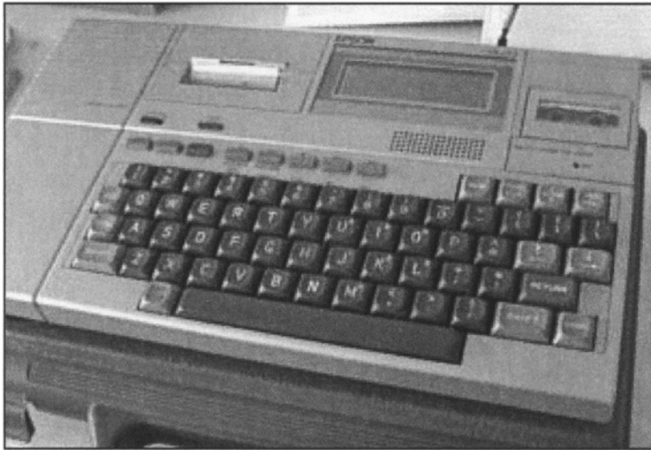
Figure 1. The Epson HX-20 microcomputer

were cheaper and already had a significantly larger user base than the Epson HX-20. (Gergen, 1986)