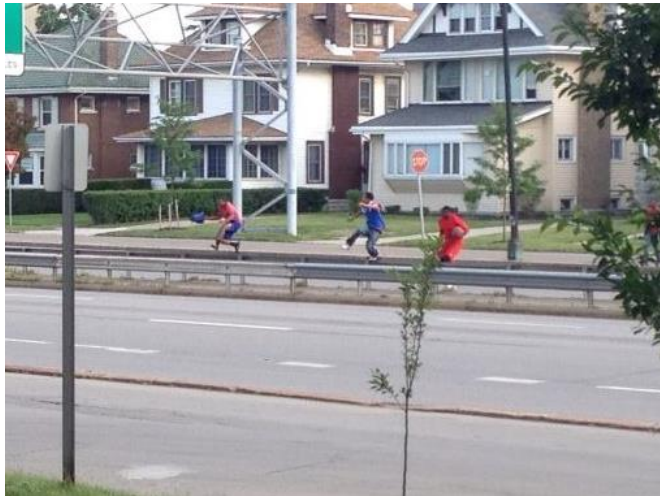
Figure 4: Youth Crossing the Expressway