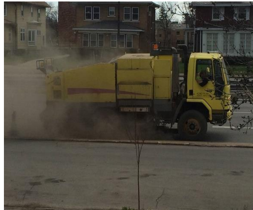
Figure 3 Street sweeper attempting to clean large volumes of traffic dust adjacent to a residential neighborhood. Dust generated along expressways comes from exhaust as well as tire wear, asbestos from brake dust, road paints, and organic dust contaminated by fluids that leak from vehicles.