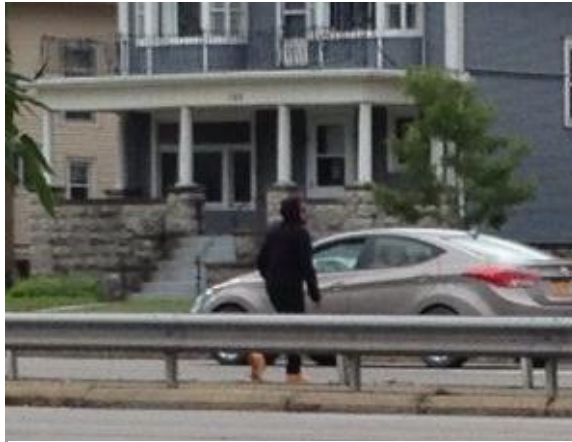
Figure 8: Pedestrian in the Expressway

Businesses and cultural institutions do not thrive just because trucks can deliver goods to them. They also need consumers traveling by car, bus, bike, or foot. Numerous studies have shown that non-motorized consumers spend as much, if not more, as motorized consumers. And businesses do not suffer when they cater to pedestrians and bicyclists, even if it means sacrificing motorized transportation infrastructure such as parking spaces. 12