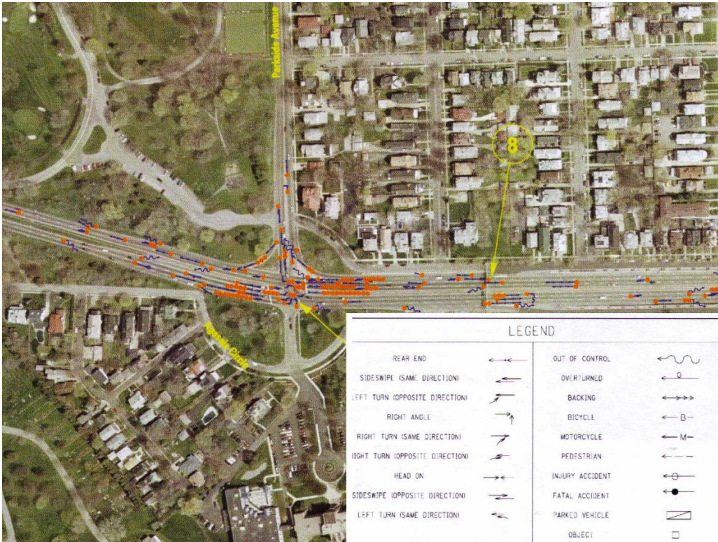
Figure 6: NYSDOT Map of Accidents near Parkside Avenue Intersection

document, a portion of which is shown below. 5 Making the entire corridor as safe as possible must be the first priority in the redesign.