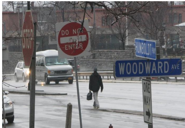
Figure 1: Pedestrian in the Expressway

Executive Order from Governor Cuomo reducing the speed limit – following an avoidable tragedy in May 2015, in which one child was killed and another permanently injured in Delaware Park by an expressway motorist.