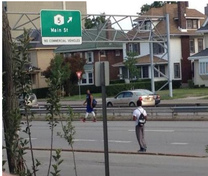
Figure 7: Youth in the Expressway

tragic collision in Delaware Park, not be raised. As illustrated in the photographs accompanying this brief, pedestrians are at particular risk in the eastern section, which is surrounded by a densely occupied neighborhood, two colleges, a hospital, a subway station and Delaware Park. The Expressway is an eight-lane barrier to the many pedestrians and cyclists that use the area, and the lack of safe crossings lures many into jaywalking across all eight lanes.