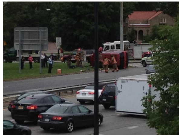
Figure 5: Rollover accident on the Scajaquada Expressway at Parkside Ave

We were born and raised in a car-oriented culture. As such, we often take for granted the dangers that motorized traffic presents. According to the Center for Disease Control, 33,804 people died from motor vehicle traffic deaths in 2013 – almost 200 more deaths than all deaths related to firearms the same year. 3 And unfortunately, the Scajaquada Expressway is a particularly dangerous roadway.