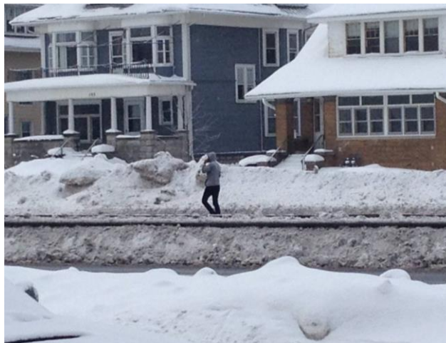
Figure 2: Pedestrian in the Expressway

In 2005, the City and NYSDOT conducted a study known as the Expanded Project Proposal (EPP) to analyze the feasibility of downgrading the Expressway between Parkside Avenue and Grant Street. The purpose of this study was to find a way to redesign the roadway so as to alleviate the negative impacts it has had on the community. With significant public input, the EPP established a preferred design alternative that reduced the vehicular speed to 30 miles per hour, improved the aesthetic of the roadway, and incorporated pedestrian crossings and bicycle lanes. The EPP study indicated that this preferred design alternative would greatly improve connectivity and both access and overall quality of life for residents and park visitors, while having little to no impact on vehicular travel times through this short stretch of roadway.