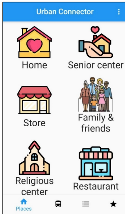
Figure 1 Urban Connector home screen of the version used to build the social connectivity functionality