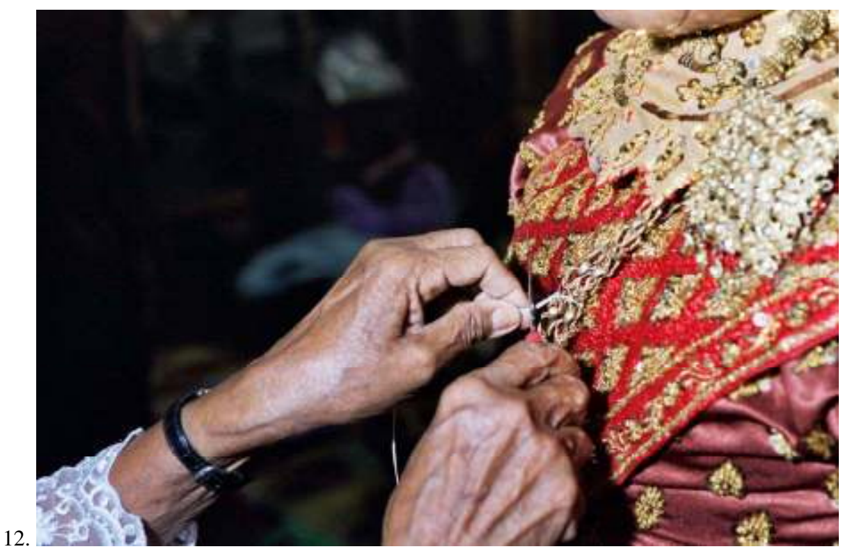
A close-up of a lakhon khol dancer being sewn into costume.