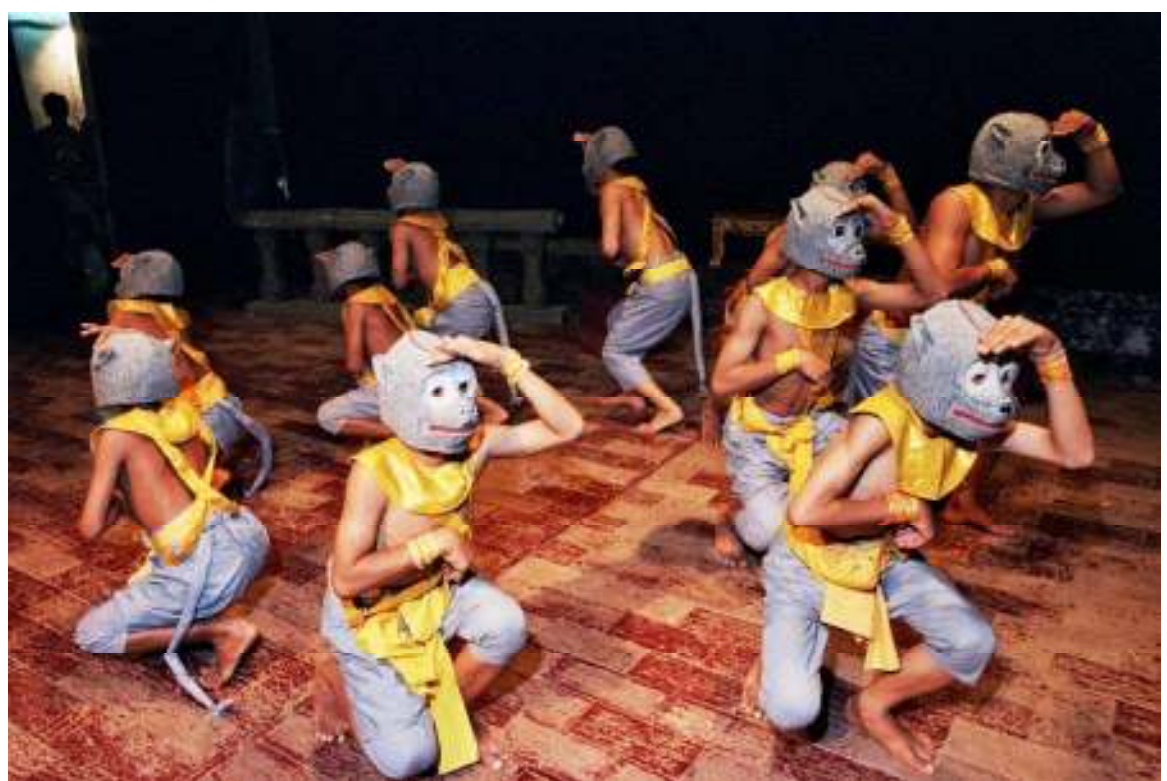
Preah Ream's monkey soldiers on high alert. "Veyreap's Battle," Department of Arts lakhon khol troupe, Royal University of Fine Arts Theatre.