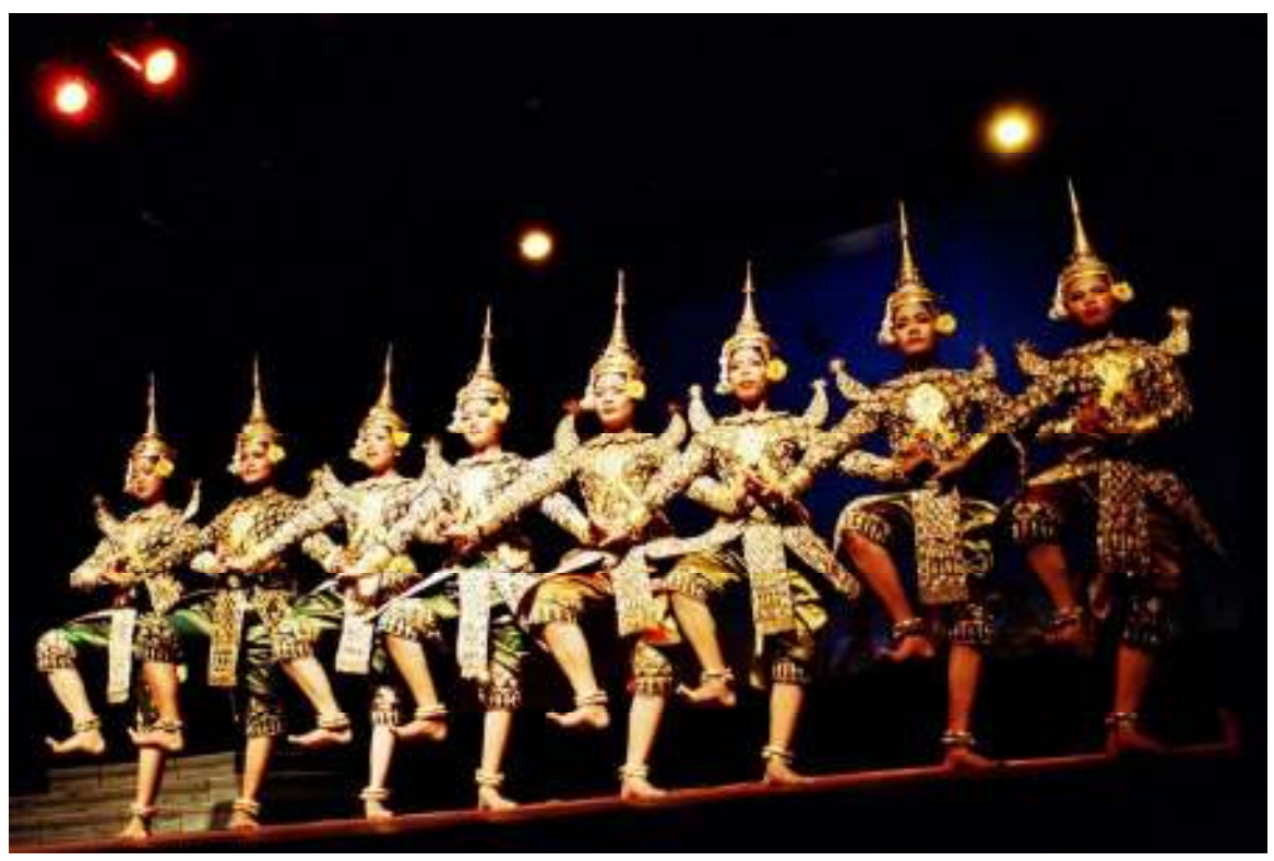
22. Realizing a state of inner equilibrium, the dancers strike poses of content and balance. "Seasons of Migration," Royal University of Fine Arts troupe, Royal University of Fine Arts Theatre.