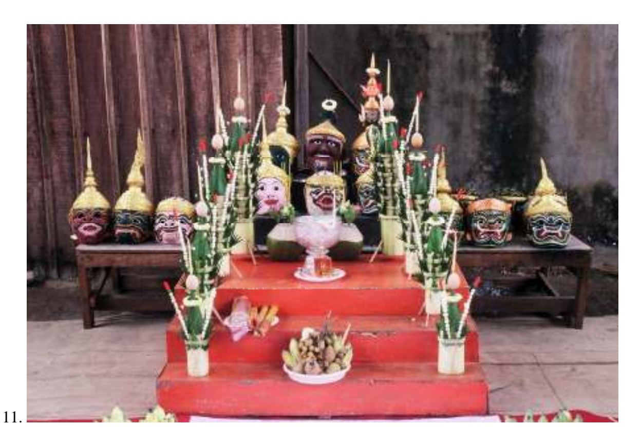
A lakhon khol sampeah kru ceremony altar. This one was prepared for a ceremony prior to a performance of the Department of Arts lakhon khol troupe in the capital city.