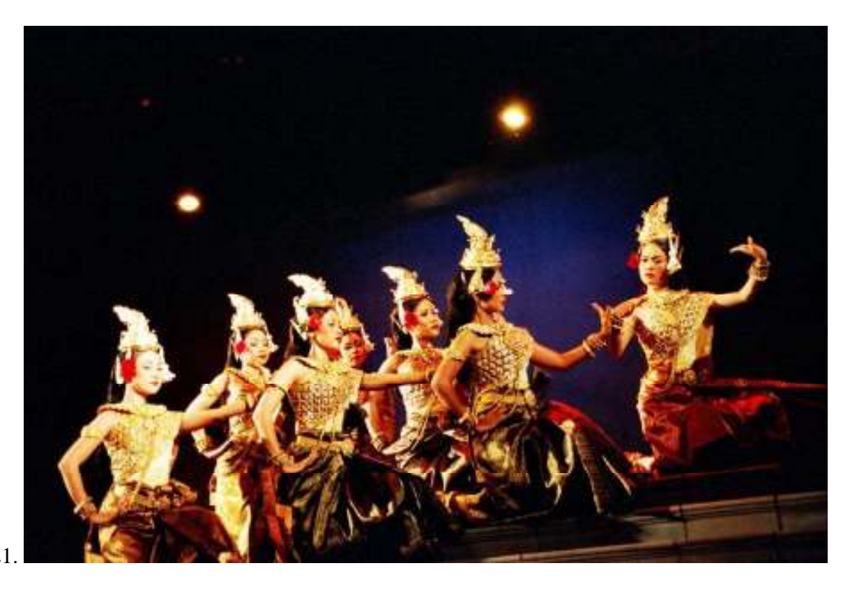
Dancers navigating the relationship between shadow and light. "Seasons of Migration," Royal University of Fine Arts troupe, Royal University of Fine Arts Theatre.