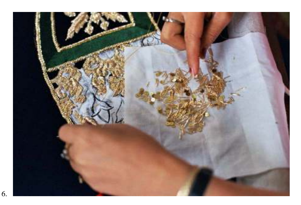
A detail of #5.