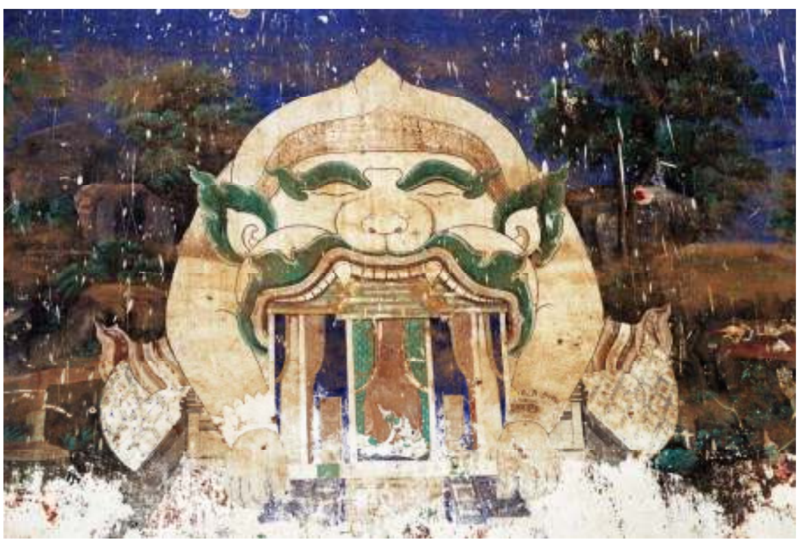
14. A scene from the Reamker mural painting in the Royal Palace compound depicting the enlarged Hanuman with Preah Ream in his mouth.