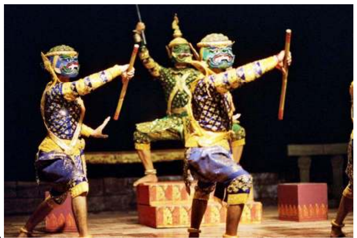
The giants prepare for a confrontation with the monkeys. "Veyreap's Battle," Department of Arts lakhon khol troupe, Royal University of Fine Arts Theatre.