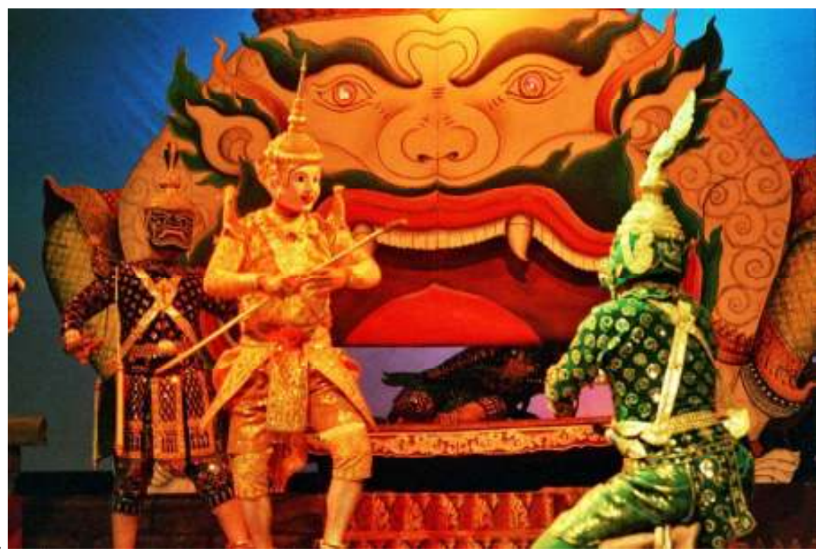
Preah Leak speaking to Preah Ream in front of the enlarged Hanuman, as the monkey waits to protect the prince. "Veyreap's Battle," Department of Arts lakhon khol troupe, Royal University of Fine Arts Theatre.