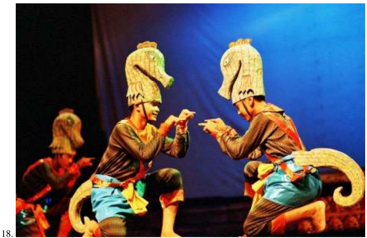
Seahorses. "Veyreap's Battle," Department of Arts lakhon khol troupe, Royal University of Fine Arts Theatre.