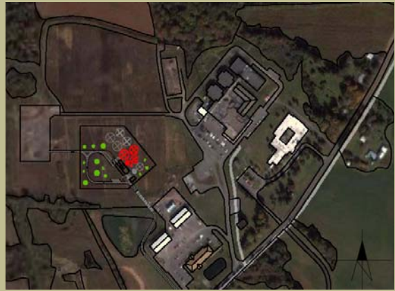
Digester site location