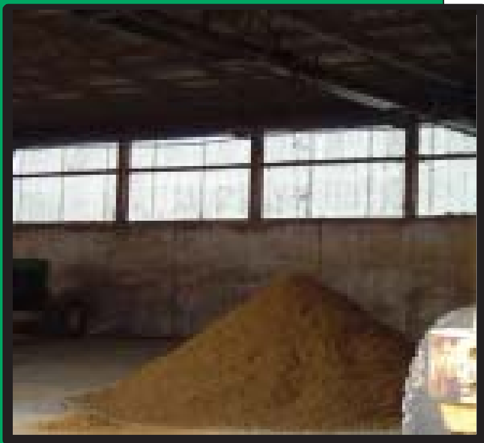
Separated manure solids used for bedding and sold as compost