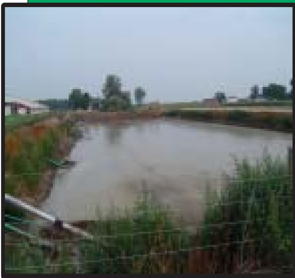
Separated liquid long-term storage