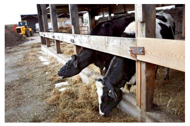
Figure 2. Cows at Zuber Farms