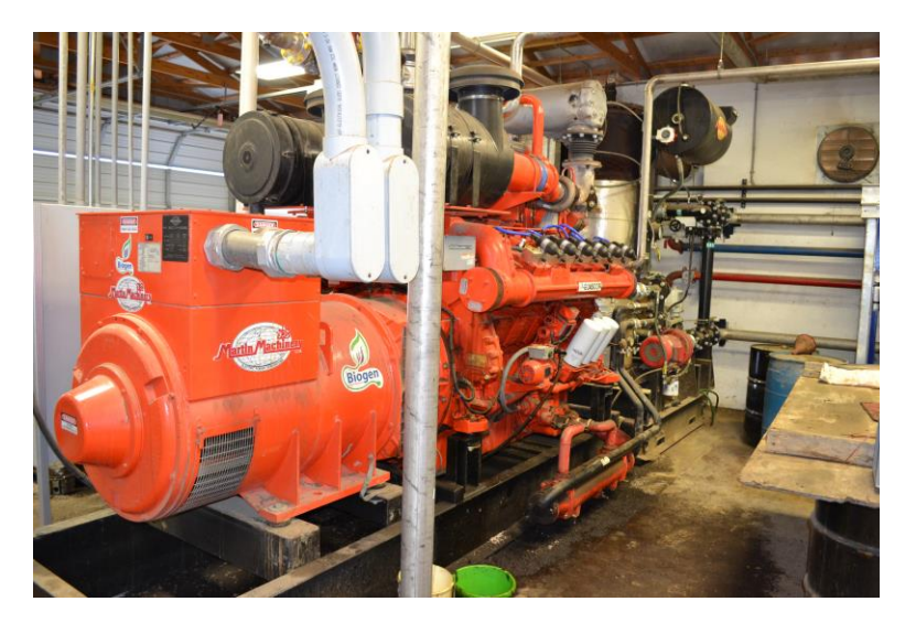
Figure 5. Guascor CHP unit

A Guascor 380-kW CHP unit utilizes the biogas produced by the digester (figure 5.). The engine is a 12 cylinder engine, and oil changes are performed about once every 13 days. Using the NYS Net Metering law, Zuber's Farm uses the electricity that they generate to power the farm as well as several houses where employees live. The excess electricity is sold to National Grid utility. The heat from the engine is used to maintain the temperature in the digester at about 99 degrees Fahrenheit.