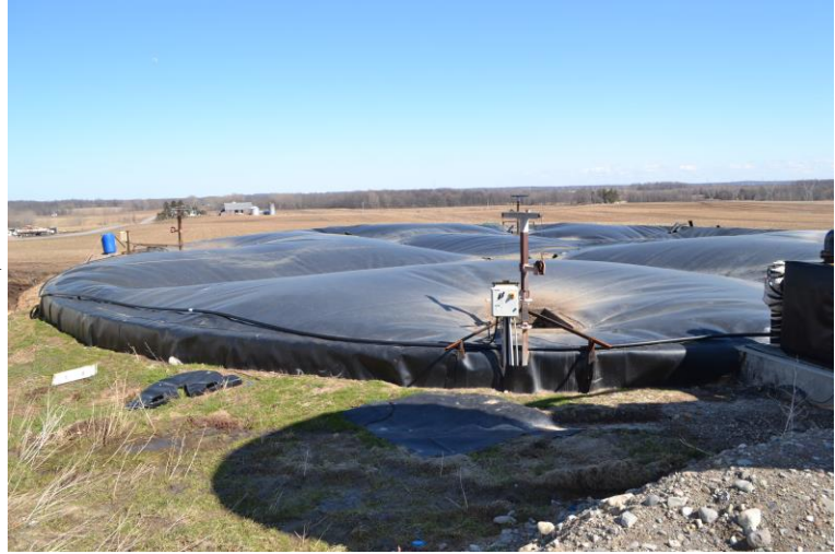
Figure 1. Anaerobic digester at Zuber Farms