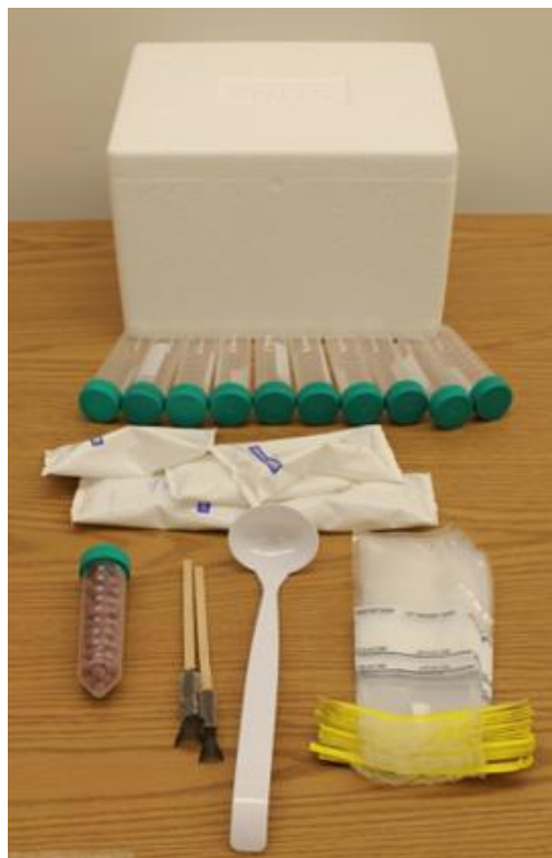
Materials included in the kit