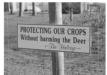
Figure 10. Woven-wire fences are the most effective way to protect large areas (>50 acres) of high value crops.