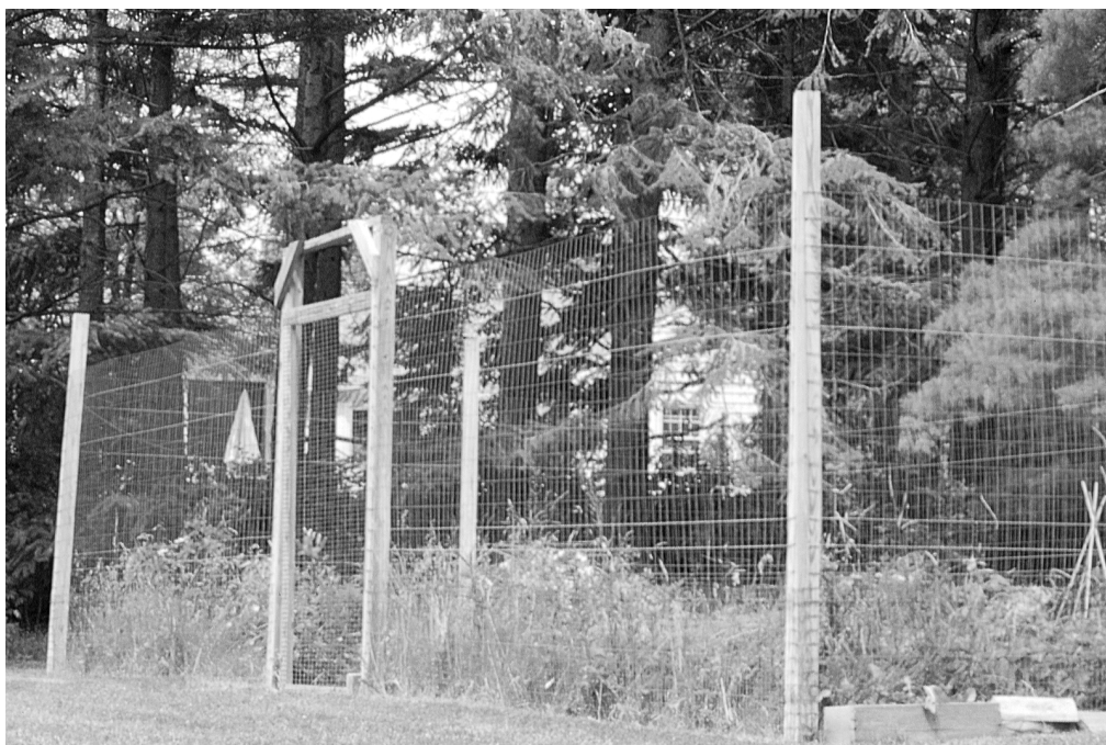
Figure 9. High-tensile barrier fence for protecting a home garden from deer damage

A wide variety of fencing systems, including baited single wires (Porter 1983, Hygnstrom and Craven 1988), three-dimensional outriggers (Tierson 1969), and slanted and vertical fences up to eleven feet in height (Longhurst et al. 1962, Halls et al. 1965, Palmer et al. 1985), have successfully excluded deer under some conditions. Often simple designs are effective only under light deer pressure (Brenneman 1983, McAninch et al. 1983) or for relatively small areas. Low-cost, easily constructed fences may perform quite well for small areas (less than ten acres) during the growing season when alternative foods are available to deer. Low-profile fences, however, are seldom satisfactory for protecting commercial orchards or ornamental plantings in winter, especially if snow restricts deer from using alternative food sources. Landowners must also check local ordinances and covenants to determine if electric fences can be used, or if fences of any kind can be constructed on their property.