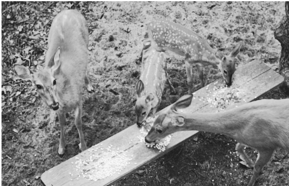
Figure 7. Feeding stations for observing deer may increase fawn production from adult females in good condition.

Repellents have traditionally been classified as odor- or taste-based products. Examples of odor-based repellents include products containing rotten eggs, soap, predator urine, blood meal, and other animal parts. Typically, these repellents are poured onto absorbent cloth or placed in a bag and suspended above the ground at densities of up to 1,150 bags/acre (Conover