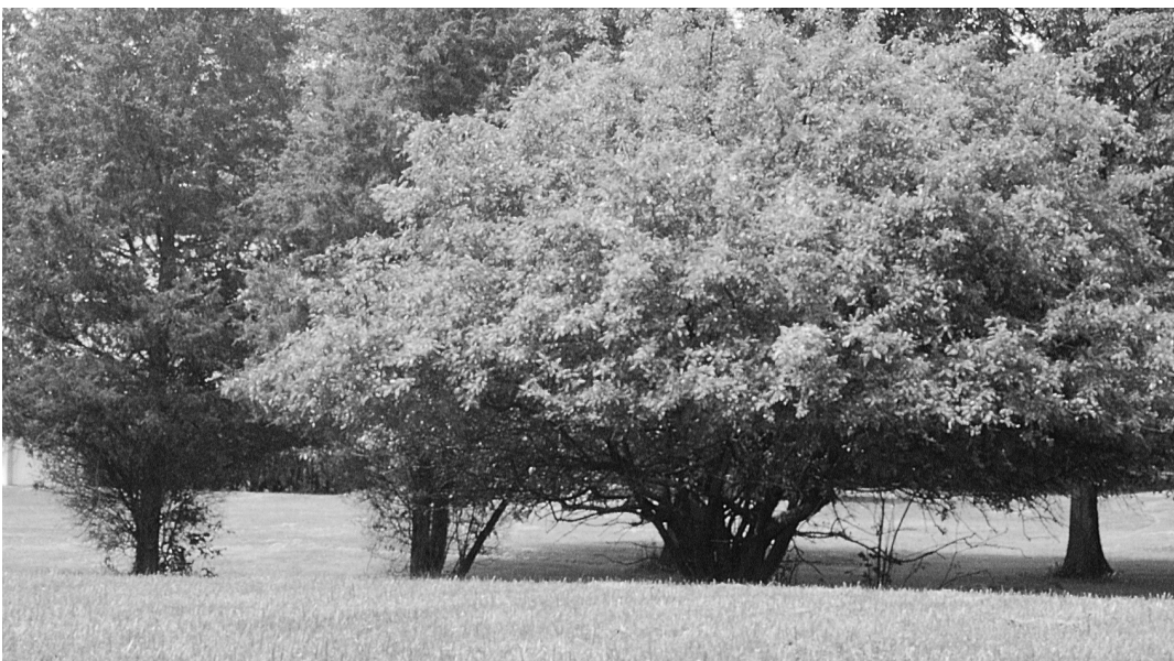
Figure 3. Overabundant deer remove vegetation to a height of approximately six feet, creating a browseline.