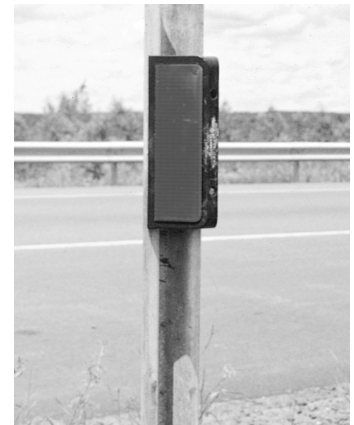
Figure 13. It is not clear that roadside reflectors will consistently reduce deer-vehicle accidents.

Wildlife warning whistles (deer whistles) attached to cars have been used in an attempt to reduce deer-vehicle collisions. These whistles operate at frequencies of 16 to 20 kHz and are intended to warn animals of approaching vehicles. There is no research,