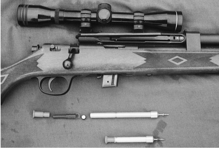
Figure 20. Dart rifle used for delivery of antifertility agents, vaccines, and immobilizing drugs