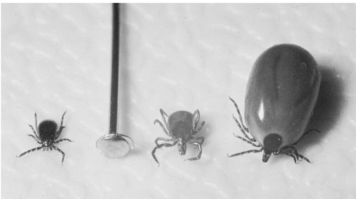
Figure 2. Male, female, and engorged black-legged ticks, with stick pin as reference.

Agricultural producers have indicated that deer cause more damage than other wildlife species (Conover and Decker 1991, Conover 1994, Wywiałowski 1994). Agricultural damage by deer was greatest in the northeastern and northcentral United States, with at least 41 percent of producers reporting damage (Wywiałowski 1994). Conover (1997) conservatively estimated annual deer damage to agriculture at $100 million.