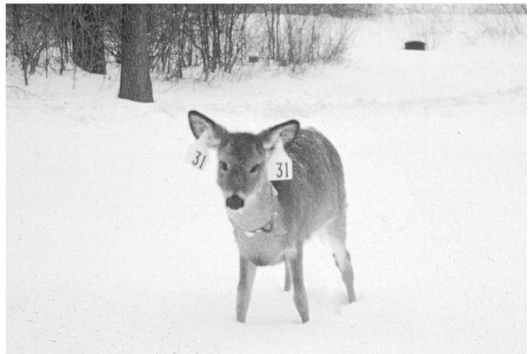
Figure 19. Cattle ear tags and radio collars are used to individually mark deer that are included in a research project.

The FDA has concerns about the safety of consuming deer treated with experimental drugs and currently requires that all treated, free-ranging deer be marked with warning tags (Figure 19) that stipulate consumption restrictions. It is not clear if or when FDA restrictions on consumption of deer meat treated with experimental drugs will be modified. In addition, fertility control agents are usually delivered to deer using either dart rifles or biobullets. Restrictions on firearms discharge in suburban areas often limits practical delivery of drugs to free-ranging deer. Consequently, there are many aspects of the regulatory and commercialization process and delivery systems that still need to be developed before contraceptive vaccines can be a viable management alternative for communities with overabundant deer herds.