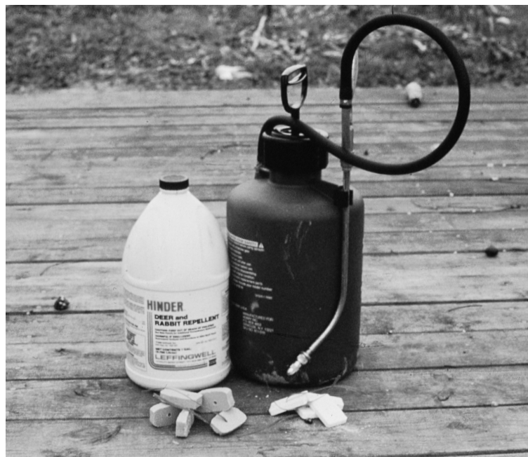
Figure 8. Several commercial repellents may reduce feeding damage for five or more weeks depending on deer foraging pressure and density.

Putrescent whole egg solids are the active ingredient in several odor-based, fear-inducing repellents (e.g., Deer-Away, Deer-Off, Deer Stopper, Big Game Repellent) that have been shown to be effective in