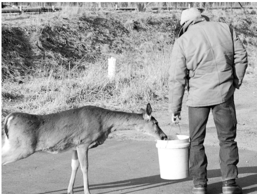
Figure 4. Feeding deer increases the potential for conflicts by making deer less wary of people.

White-tailed deer are extremely adaptable, both in habitat and diet selection. Deer are an edge species, faring well in transitional areas between forests, agriculture, grasslands, and even suburban landscapes. Forests, thickets, and grasslands provide deer with protective cover and natural foods, and agricultural fields can contribute abundant, high-quality forage. The diets of white-tailed deer often depend on the