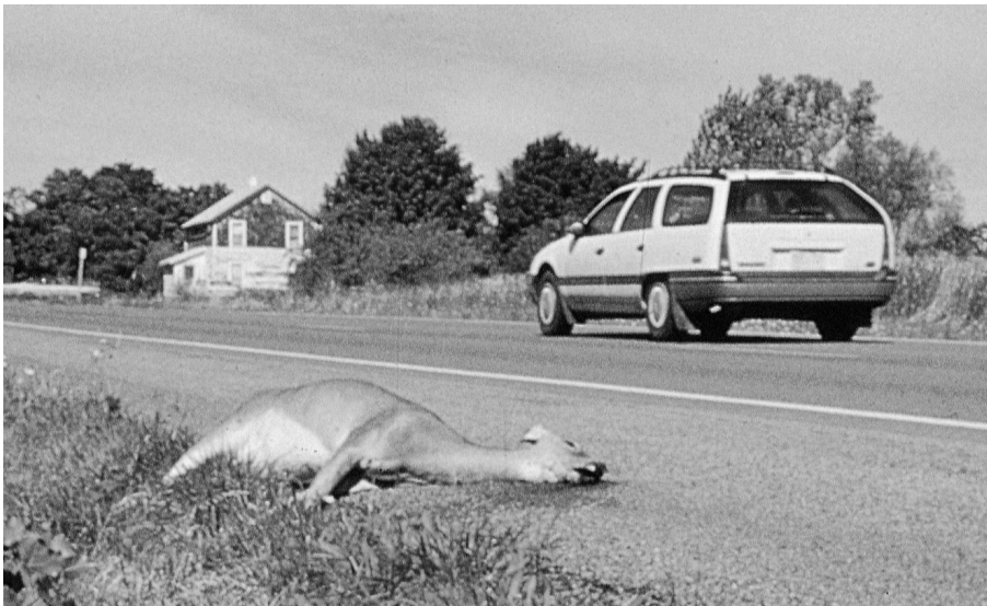
Figure 12. As deer densities increase in suburban areas, deer-vehicle collisions are occurring more frequently.

Deer-related vehicle accidents (Figure 12) are a major concern in some communities, and collision rates are apparently correlated with deer abundance. Several techniques have been used to reduce deer-car collisions, however few have been documented to be consistently effective, and some have no measurable effect on deer behavior.