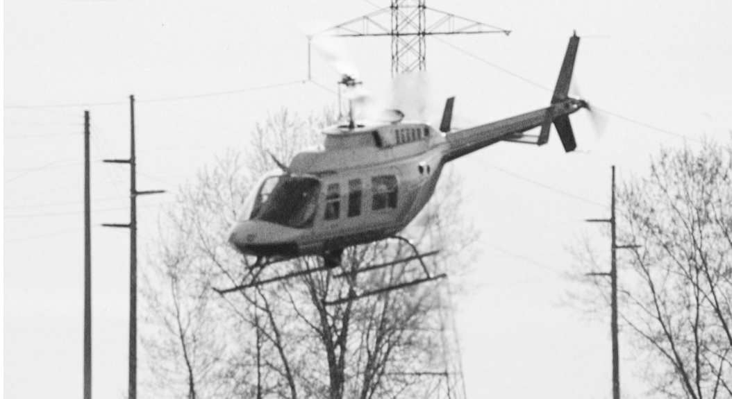
Figure 6. Helicopter surveys can be used to estimate deer abundance in areas with few conifers and four or more inches of snow cover.

To complement population estimates, the physical condition, mortality, and reproductive rates for deer should be monitored regularly to more accurately model deer populations over time. In the absence of population estimates, population indices (e.g., pellet-group counts, numbers of complaints or conflicts, etc.) may suffice as indicators of relative changes in deer abundance.