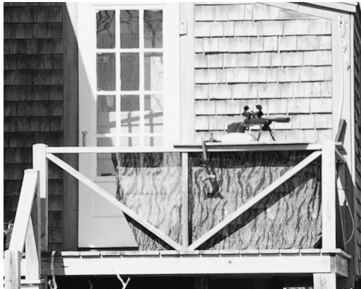
Figure 17. Blind and rifle on a raised deck used as a sharp-shooting station

Several communities have employed trained, experienced personnel to lethally remove deer through sharpshooting (Figure 17) with considerable success (Deblinger et al. 1995, Drummond 1995, Jones and Witham 1995, Stradtman et al. 1995, Ver Steeg et al. 1995, Butfiloski et al. 1997, DeNicola et al. 1997c). A variety of techniques can be used in sharp-