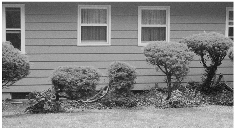
Figure 1. Browsing damage caused by repeated deer feeding on ornamental shrubs.

tors. Homeowners may consider it a nuisance when deer consume garden and landscape plantings (Figure 1). More importantly, an overabundance of deer may cause significant economic losses associated with decreased crops, vehicle collisions, or Lyme disease. Deer also affect forest ecology by feeding on preferred plants and altering the biodiversity in parks and natural woodlands. Human safety can be compromised because increases in deer-vehicle collisions are positively correlated with greater deer abundance (Blouch 1984, Etter et al. In press). For example from 1984 to 1994, as the deer population climbed in the community of Bellvue in Sarpy County, Nebraska, the number of deer-vehicle collisions in that county increased 325 percent (Hygnstrom and VerCauteren 1999). Conover et al. (1995) estimated that more than 1 million deer-vehicle collisions occur annually in the United States, and that annual vehicle repair costs from those accidents exceeded $1.1 billion. They further estimated that each year 29,000 human injuries and 211 human deaths occur as a result of deer-vehicle collisions. Although these numbers are low compared with other sources of human fatalities, they are of concern.