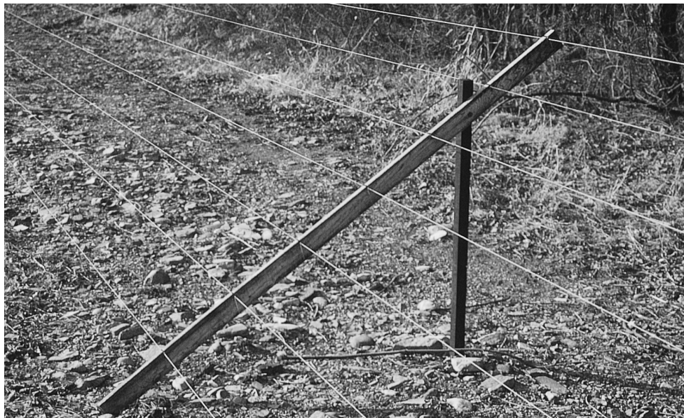
Figure 11. Deer have poor depth perception and will avoid areas protected by electrified, slanted-wire fences.

Multistrand, electrified, high-tensile, smooth-wire fences consist of several individual wires fastened to braced wooden assemblies, with wires tightened to 150 to 250 pounds of tension (McAninch et al. 1983, Palmer et al. 1985). Sturdy, well-braced corner and