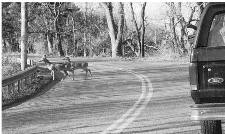
Figure 14. Deer often travel in family groups, so motorists should be cautious if one or more deer are seen on the roadside.

Highway departments install fencing along roadsides for many reasons in addition to preventing deer-vehicle collisions. The effectiveness of fencing for reducing numbers of deer-related accidents is limited unless properly maintained “deer-proof” fences are installed (Falk et al. 1978, Feldhamer et al. 1986). Romin and Bissonette (1996) reported that only ten states used fencing combined with overpasses/underpasses to lower deer-vehicle accidents, but more than 90 percent of state highway departments indicated fencing was effective for preventing animal-vehicle collisions. A 90 percent reduction in deer-vehicle accidents was achieved along a 7.8-mile section of I-70 in Colorado after the construction of an eight-foot-high deer fence (Ward 1982). Accident rates were also reduced in Minnesota (Ludwig and Bremicker 1983) and Pennsylvania (Faulk et al. 1978, Feldhamer et al. 1986) by constructing “deer-proof” fences. It appears that deer rarely jump nine-foot fencing (Feldhamer et al. 1986). Fencing must be frequently inspected with breaks or erosion gullies quickly repaired, because deer will find gaps or weak points where they can cross (Foster and Humhrey 1995, Ward 1982). Bashore et al. (1985) concluded that fencing was the cheapest and most effective method for reducing deer-vehicle collisions along short stretches of highway.