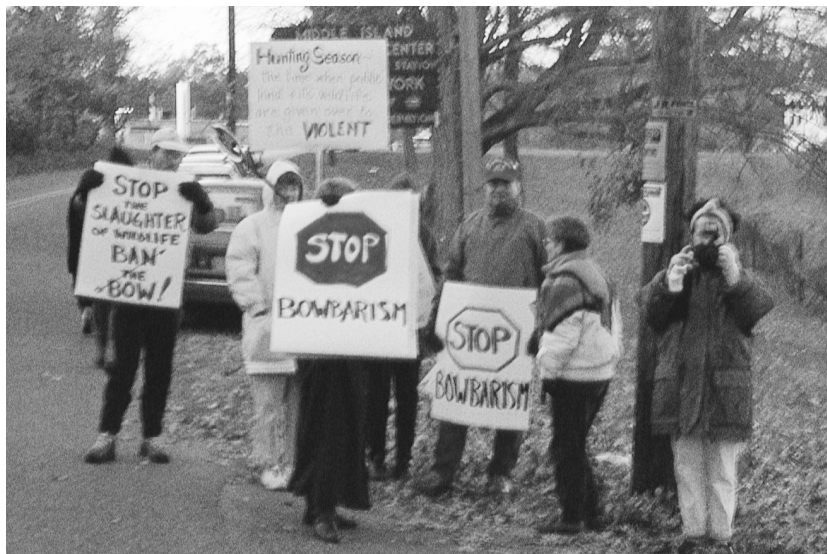
Figure 5. Animal activist groups may oppose controlled hunts, sharp-shooting programs, and other lethal forms of deer removal.

forces and similar transactional approaches (Chase et al. 2000, Curtis et al. 2000a). Communities are now sharing not only the decision-making authority, but also the cost and responsibility for deer management with state and local government agencies under a variety of co-management scenarios. The community scale is appropriate as deer impacts are often recognized by neighborhood groups, and the need for management becomes a local issue. In addition, the success or failure of management actions can be perceived most readily by stakeholders at the community level. Outcomes of co-management are usually perceived as more appropriate, efficient, and equitable than more authoritative wildlife management approaches. Although co-management requires substantial time and effort, this strategy may result in greater stakeholder investment in and satisfaction with deer management.