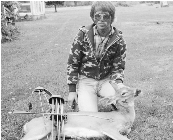
Figure 18. Bowhunters can remove deer from suburban locations where firearm hunts are impractical.

The potential for intervention and/or interference by activist groups is often high when using hunters to manage locally overabundant deer populations. Thus,