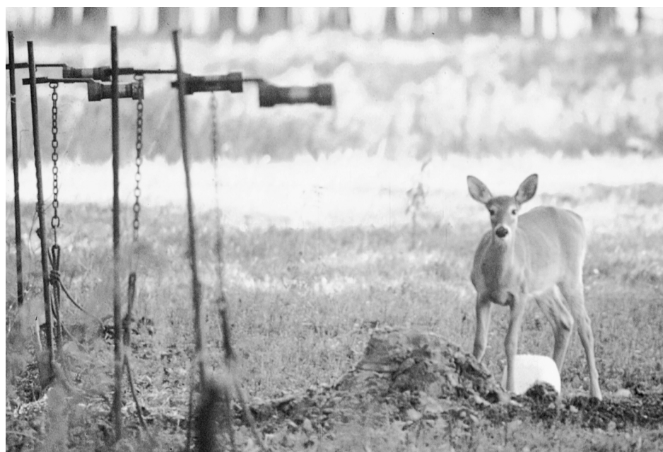
Figure 16. Rocket net positioned and ready for deer capture at a bait station

If capture and translocation is selected as the most appropriate management option, the following recommendations will minimize stress and subsequent capture myopathy during handling procedures. Only experienced personnel should be involved in deer handling or in the immediate area of the capture site. When physically restraining deer (i.e., net guns, drop nets, rocket nets, Clover traps) it may be advantageous to sedate each animal while extracting them