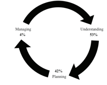
Figure 1: Cycle of the flood adaptation process. Percentages represent the number of quotes categorized within each adaptation stage, made by Hudson Valley municipal officials during interviews.

planning, and management (Figure 1). Using such a framework helps organize and identify where in the adaptation process municipal officials encounter barriers. The framework can also help advance efforts to overcome those barriers and address flood adaptation more effectively. A qualitative analysis of the interview data revealed that the majority (53%) of quotes could be categorized within the Understanding stage. Less than half (42%) of the quotes were categorized within the Planning stage, while only 4% of were categorized in Managing stage (Figure 1). The results of this categorization scheme raise the question about why these municipal officials are not further along in the adaptation process and what resources they may need to move their municipalities through the process more effectively.