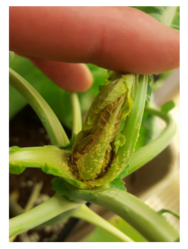
Figure 3. Yellow larvae feeding on cauliflower

All varieties of Brassica oleracea vegetables, including broccoli, cauliflower, Brussels sprouts, cabbage, collard greens, kale, and kohlrabi, are susceptible to swede midge damage. Canola, mustards, and Asian greens, including Chinese cabbage and bok choi ( B. rapa and B. napus ) are also host plants for swede midge. Swede midge larvae feed on the growing points of their host plants, resulting in scarred stems, deformed leaves, multiple shoots or heads, uneven development and