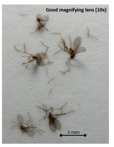
Figure 4. Jackson trap for monitoring swede midge (left) and males caught in trap (right). 2 \text{ mm} = \sim 1/16 "