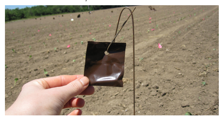
Figure 6. PMD pheromone dispenser.

Plant essential oils applied to crops in foliar sprays can deter oviposition by pests and can be toxic to larvae. Several essential oils, including garlic, lemongrass, oregano, and thyme, showed promise for swede midge management in laboratory trials at the University of Vermont, however, field trials did not find garlic essential oil to be effective. Additional field trials are underway to test other essential oils.