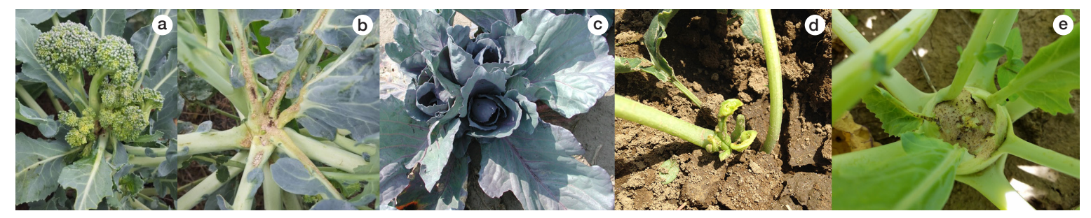
Figure 2. Swede midge damage symptoms in Brassica crops: Uneven head development (a) and death of head/blind head (b) in broccoli, multiple heads of cabbage (c), distorted growing tip in kale (d), and brown corky scarring of kohlrabi (e).

lay eggs within the newly developing leaves in the growing point of their host plants. Eggs hatch into small ( \sim 1/8") larvae that become yellow with age and are visible to the unaided eye (Fig. 3). Swede midge larvae are hidden within the growing point where they are protected from contact with foliar insecticides. After feeding for 7-21 days, larvae jump off of the plant to the ground and develop into pupae, which reside in the top 0.5" of soil beneath their host plant (Ref. 2). In the fall, pupae remain in the soil and overwinter in cocoons, emerging as adults in May. Although most overwintering pupae emerge the following year, some may stay in the soil and emerge in the second or third spring.