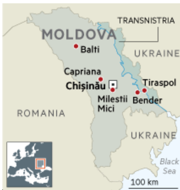
Figure 3: Moldova and Transnistria

The Pridnestrovian Moldavian Republic (PMR), commonly referred to as Transnistria, is a breakaway republic wedged between the Republic of Moldova and Ukraine (see Figure 3). This sliver of land follows the course of the Nistru River, and covers 4,000 sq km. Its population – more than half a million people – speaks Russian, Moldovan, and Ukrainian. Transnistria has its own capital – Tiraspol – its own currency – the Transnistrian rouble–, its own Parliament and Constitution, as well as its own flag and anthem. The Moldovan authorities do not have administrative control over the railway crossing points between Transnistria and Ukraine, such as the one between Pervomaisc and Kuchurhan (see Figure 4). 30 A railway connection links Ungheni (passing through Chişinău) to Tiraspol and then to Odessa (in Ukraine). Railway traffic between Chişinău and Tiraspol is occasionally closed because of political tensions between Moldova and Transnistria. 31