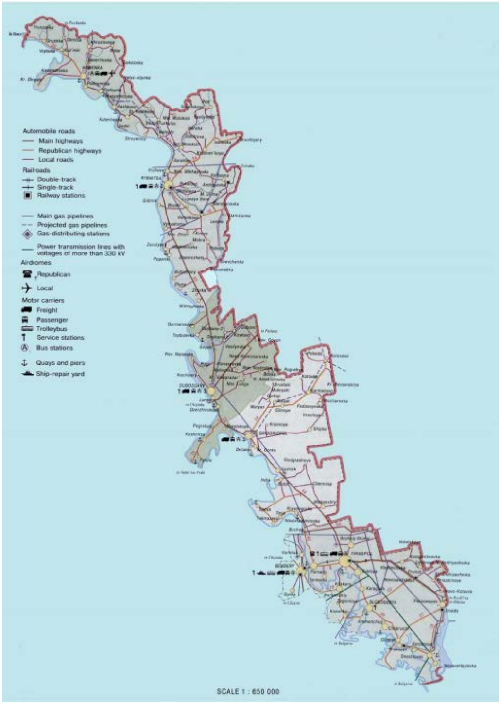
Figure 4: Transportation routes in Transnistria.

The conflict between the Republic of Moldova and Transnistria began in 1990, when Tiraspol declared its independence from Chişinău, fearing a scenario in which Moldova and Romania reunited. During the Soviet era, Transnistria was the most economically developed part of Moldova, concentrating almost 90% of electricity production and one third of the Moldovan