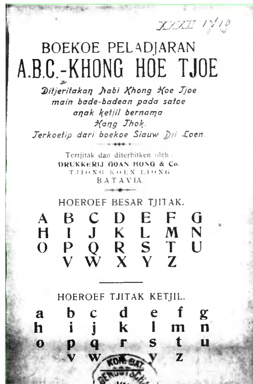
Figure 4. The 1929 schoolbook, title page.