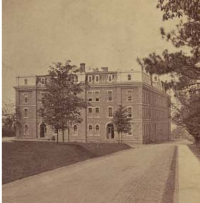
Cascadilla Place. Stereoscopic photograph [detail], ca. 1866.