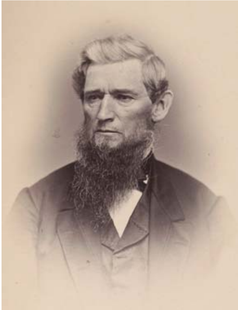
Ezra Cornell, 1865. From The Photographic Senatorial Album of the Empire State, 1864-65. Albany, N. Y.: Churchill & Dennison, [1865]