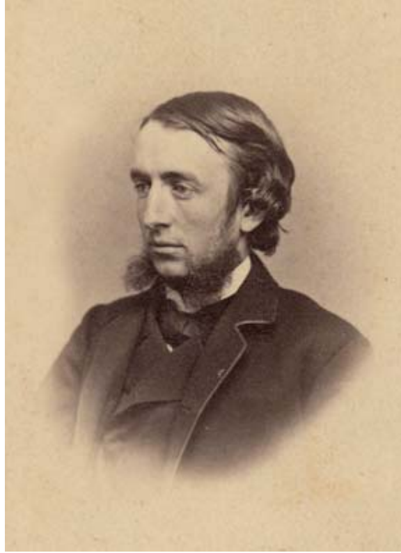
Andrew Dickson White. Albumen print photograph, ca. 1868.