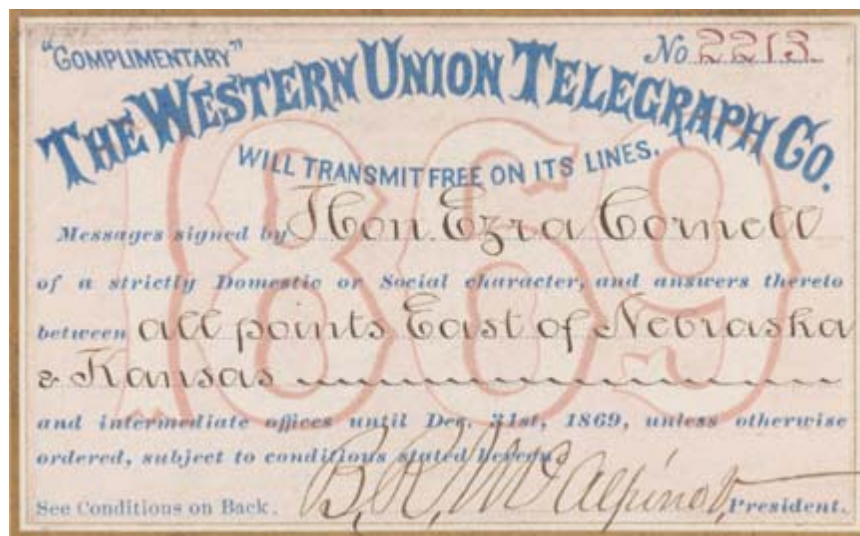
Western Union Pass for Ezra Cornell, 1869.

Virginia, North Carolina, and Georgia, he frequently commented on slavery, the plantation system, and the general backwardness of the area. In describing the malignant effect of slavery, he wrote his wife and children on August 18, 1844: “this ‘Sunny South’ this land of praise, is cursed with human slavery. The Soul of man is made an article of merchandize by his fellow man and can such a land be happy? No! Happiness does not dwell in any land that is scard by the blighting curse of Slavery.” 6