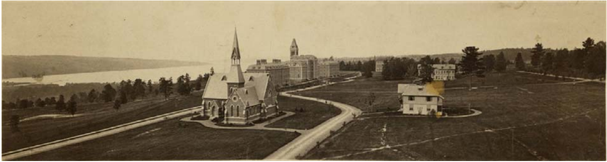
Cornell University, ca. 1875.

York State Senate's Committee on Literature (Education), a committee chaired by Andrew Dickson White of Syracuse.