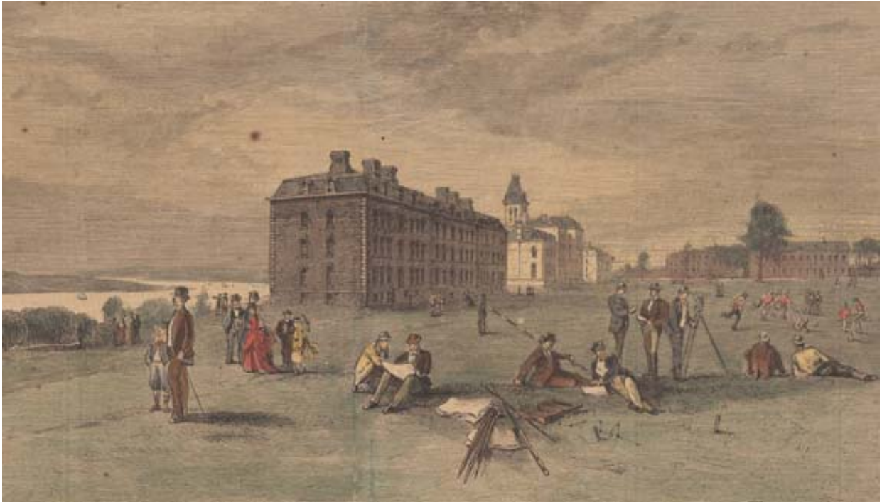
The Cornell University [Detail]. Wood engraving from Harper's Weekly, June, 1873.