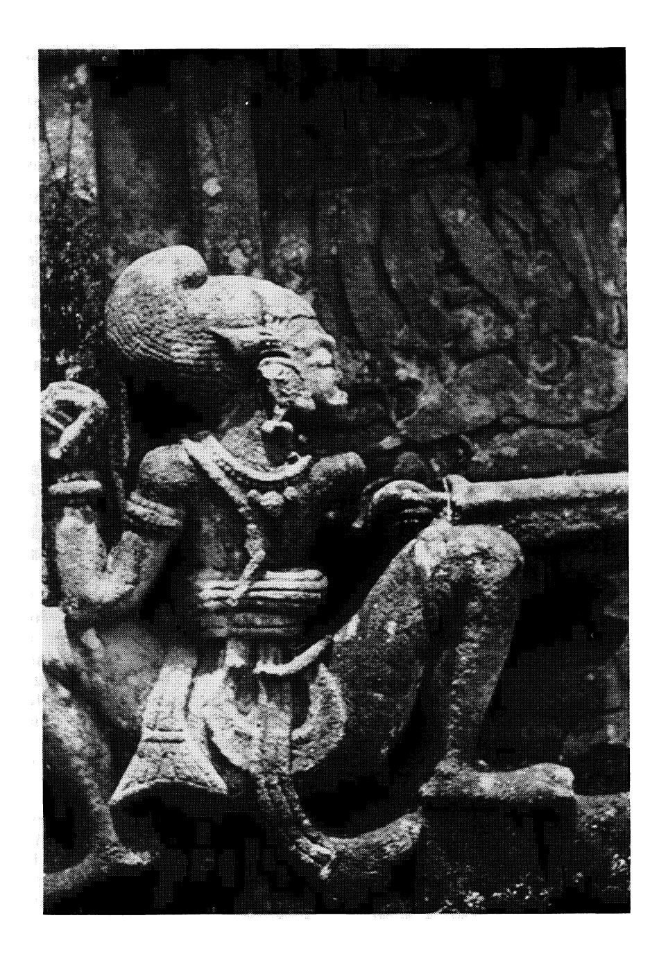
PL. 2. Detail of PL. 1 showing smith grasping tang of weapon with bare hand. Note the blade rests on the smith's knee. There is no hammer in the upraised hand.