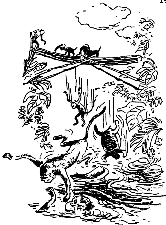
They fell into the river

Carefully, the monkeys began to carry the turtle over the bridge. When he knew they were moving with great difficulty over the bridge, the turtle began to struggle and move about, causing several of the monkeys to fall into the river, together with him and the upih pinang. In the water, the turtle turned to his "friend" trying to swim and said, "Good afternoon, my friend. How are you today?" The monkey did not say a word and continued to swim towards the bank. When he received no answer, the turtle said, "Have a good swim, my friend. I thank you with all my heart because you so willingly brought me on this excursion. Now it's time for me to go back. Until we meet again." And with that, the turtle swam towards the sea.