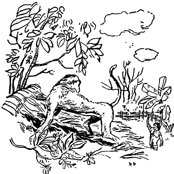
He jumped on the roof

more angry and finally went into the kitchen where he whined and rolled on the floor.