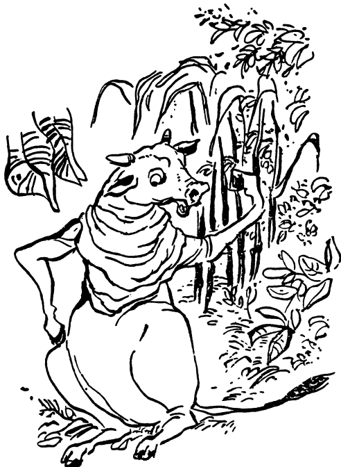
Around the neck it felt very loose

When they reached the river, the two of them took off their skins and jumped into the water. The water was cool, and the weather was no longer quite as hot because the sky had begun to cloud up. The two of them relaxed and played in the water, chewing their cud and talking without stopping. Then the clouds upstream turned black. Suddenly, while the two were deep in conversation, the river rose up and they had to scramble for their skins. In their haste the water buffalo accidentally took the cow's skin and the cow the water buffalo's. Looking for a safe place, the two friends got separated so that the cow no longer knew where his friend was.