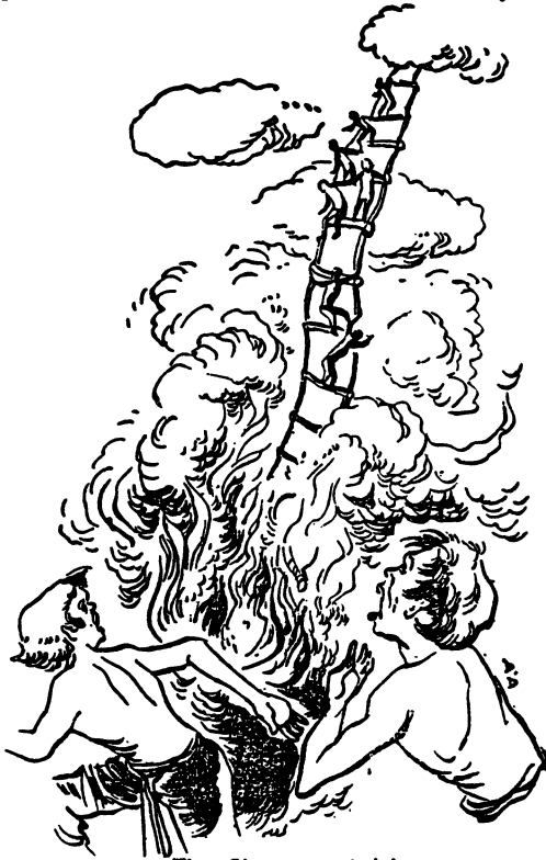
The flames got bigger

Both of them turned the coal over and over to see whether it had any teeth. When they could not find any, they sat down in desperation. Suddenly the older child cried out, "I have an idea. Let's grab the fire and put it into my blanket. I'll wrap it up so tightly that it can't bite." Then he took the coal again, wrapped it up with his blanket, and said to his sister, "Let's go home. This fire can't do anything more now."