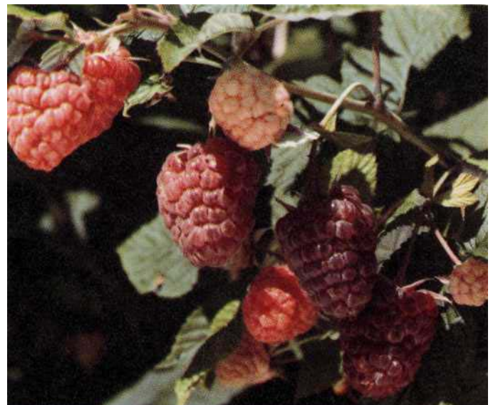
Figure 2.—fruit of 'Royalty'.

'Royalty' is among the largest fruited raspberries we have tested. It tends to be larger than 'Brandywine', which