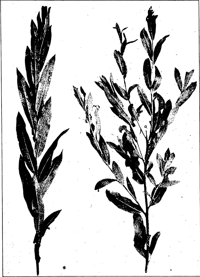
PLATE II.—PERFECT AND INJURED WILLOW WHIPS.