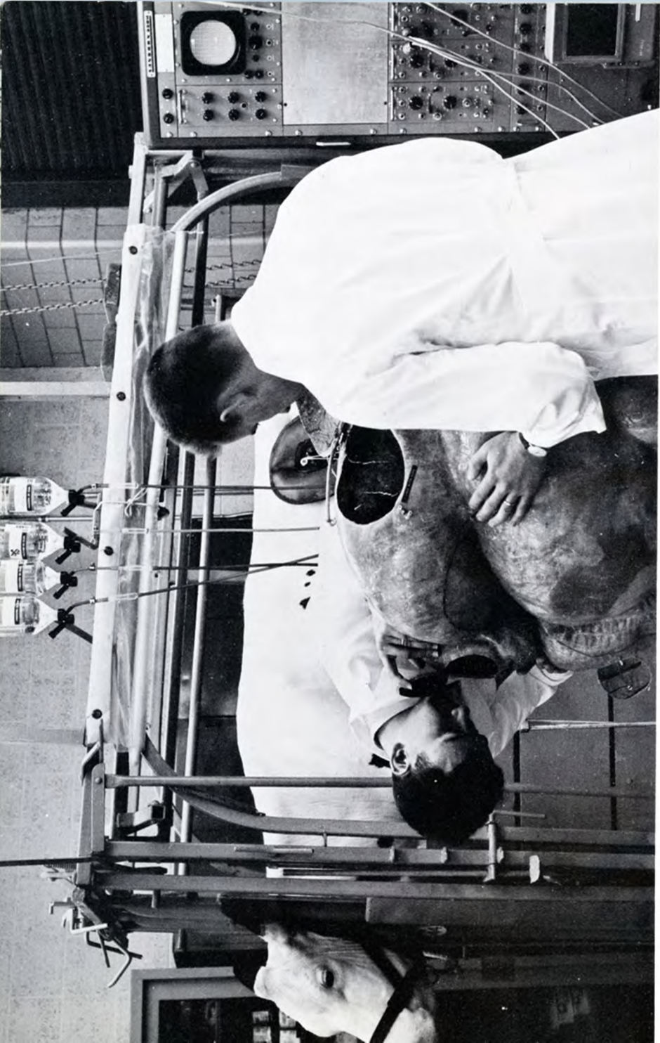
Studies in Rumen Anatomy and Physiology.