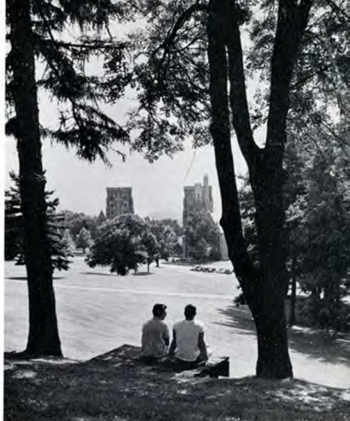
The familiar library slope, overlooking the men's dormitories.