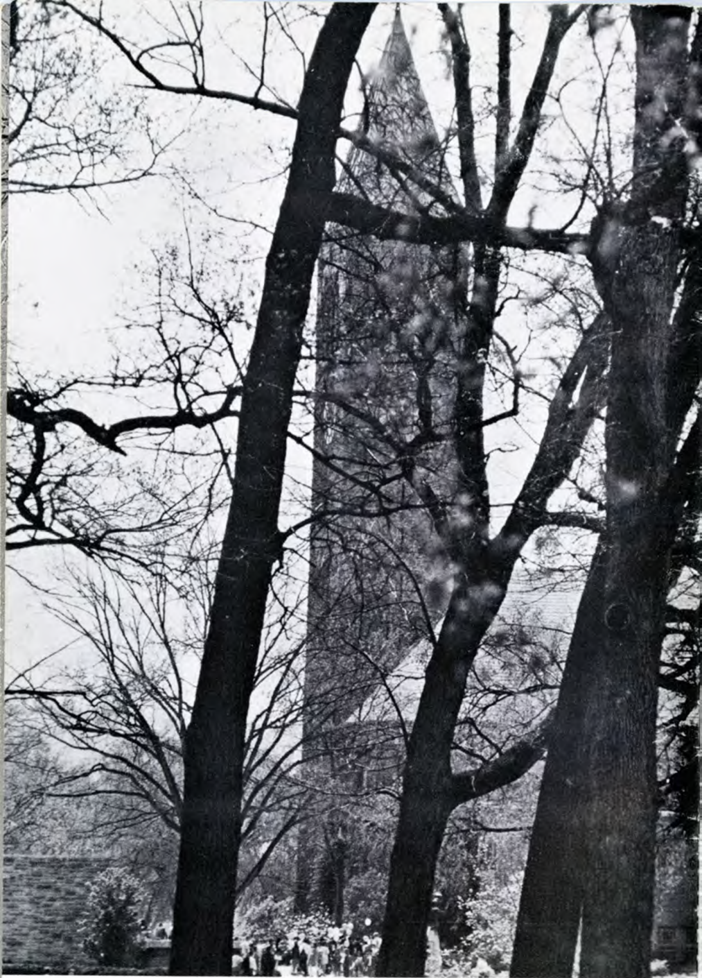
The Clock Tower on Uris Library, housing the carillon and great tenor bell.