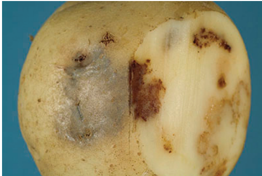
Late blight on potato tuber.

On potato tubers: Infected potatoes have shallow, brownish or purplish lesions on the surface of the tuber. If you cut across the surface of these infected areas, you'll see a reddish-brown, dry, granular rot that extends up to half an inch into the flesh. Late blight lesions can serve as pathways for other tuber diseases including bacterial soft rot to enter, so late blight symptoms can sometimes be obscured by symptoms of other diseases.