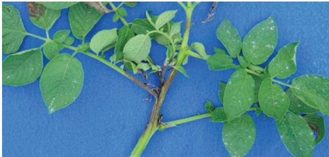
Late blight stem lesions on potato..

Because the oomycete that causes late blight produces so many spores, and the spores can travel long distances through the air, it is very important that everyone who grows potatoes or tomatoes is able to identify late blight and know how to control it, to avoid being a source of spores that infect potatoes and tomatoes in neighboring gardens and commercial fields. This disease is capable of wiping out not only your entire potato and tomato crop but also commercial fields very quickly under wet conditions, and farmers who grow potatoes or tomatoes are at serious risk of losing their entire income from these crops.