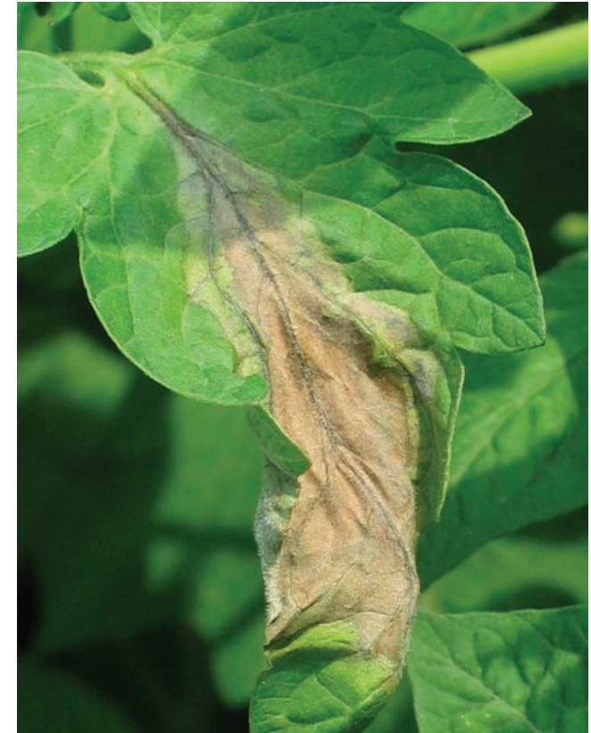
Late blight lesions on tomato leaflet.