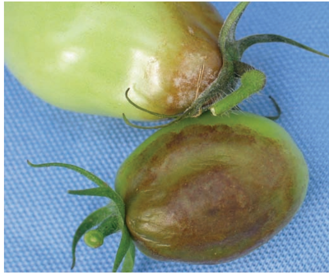
Late blight on tomato fruit.

On tomatoes: Symptoms on tomato leaves and stems are similar to those on potato. On tomato fruit, late blight causes a firm, dark, greasy looking lesion from which the pathogen spore producing structures emerge under humid conditions.