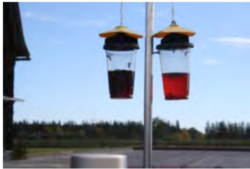
Figure 5. Paired traps at an apple orchard. The trap on the left contains a surfactant and hundreds of yellowjackets.

When data for all sites are combined, adding a surfactant improved the ability of yellowjacket traps to retain stinging insects ( G = 132.1; DF = 1; P < 0.001 ). However, the raw data suggests that one trap in particular at site A1 was responsible for this result (Figure 5). Furthermore, results from Sites A2 and A3 alone indicate that control traps were better at catching yellowjackets. Proximity of traps to yellowjacket foraging sites and the use of Dawn Dish Soap might explain these results.