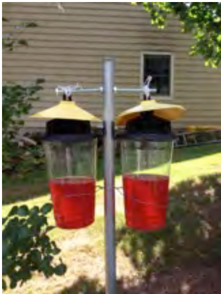
Figure 3: Side by side surfactant and control traps

Procedures: In 2015, a replicated experiment was undertaken to evaluate the role of surfactants in increasing yellowjacket trap efficacy. The experiment was conducted in both Westchester and Albany counties, and took place at a total of eight sites. This included three sites in Albany County (a residential site, an office location with abundant floral resources, and an apple orchard and farm store that contains a restaurant and cider processing center) and five sites in Westchester County (three residential and two public sites with an existing snack stand). Pairs of traps were installed at the top of an eight-foot piece of conduit (Figure 3), sunk two feet into the ground such that traps were approximately six feet above ground (Figure 4). A total of 19 paired traps were set up in early fall. All traps were baited with dilute fruit punch, and two drops of Dawn Dish Soap were added to the bait in “surfactant” treatment. This soap was selected because of its accessibility. Traps were checked weekly, yellowjackets were counted and bait/surfactant was replenished.