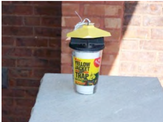
Figure 1. Yellowjacket trap

One approach to reducing the risk of yellowjacket stings is the use of container traps baited with a food attractant (Figure 1). Traps are often promoted to the public as an