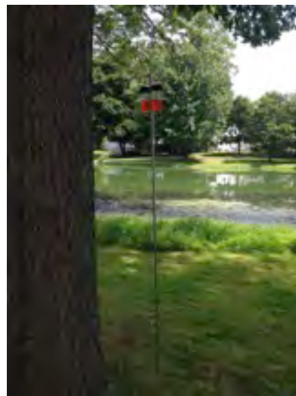
Figure 4: Side by side surfactant and control traps on 8' conduit

Results and discussion: Compared to 2014, in which yellowjacket populations were high across New York State, a paucity of insects were collected from Westchester in 2015. Combining trap catches from all five sites, a total of 20 yellowjackets were collected over a 10-week period from August to October, with no other stinging insects recorded. In comparison, a total of 1435 yellowjackets were collected from three sites in Albany County during a 7-week period from September to November. Collections also included ten paper wasps and three bald-faced hornets.