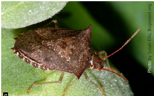
Dusky stink bug, Euschistus tristigmus .