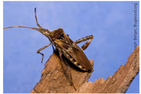
Western conifer seed bug, Leptoglossus occidentalis .