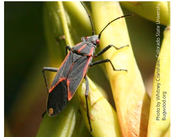
Boxelder bug, Boisea trivittata .