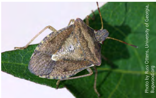
Brown stink bug, Euschistus servus .

The brown stink bug is very similar in appearance to BMSB but is less common in the northern US. Look for white banding on antennae and tarsi to identify the BMSB. The dusky stink bug has distinctly pointed “shoulders” (the pronotum) and no white banding. The four-humped stink bug has a longer, more irregularly shaped body and no white banding. These three species of stink bugs can cause damage to crops but are not known to be nuisance pests of structures.