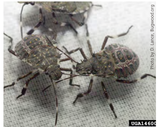
Brown marmorated stink bug nymphs.

The timing of the BMSB life cycle in New York is unclear and probably varies from downstate to upstate. However, the BMSB is thought to begin seeking overwintering sites earlier than other fall home-invading pests, such as Asian ladybeetle and cluster flies. Adults begin to move from host plant to host plant toward structures. They are attracted to landscape shrubs including holly, crabapples and other fruiting and seed-producing plants. For severe BMSB infestations, the building and its vicinity may be treated once the insects are seen in the surrounding landscape, usually late August or early September. Use only insecticides labeled to control BMSB and for use in structures and the perimeter. Have a pest management professional treat the outer structure first and in detail. The PMP should treat eaves, soffits, roof ridge vents, flashing, chimneys, louvered vents, and around windows and doors. After treating the structure, treat the landscape shrubs to kill BMSBs. Follow all label directions. This method will not prevent future problems. An emphasis on building the bugs out is recommended for long-term control.