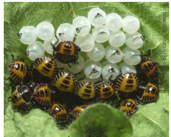
Brown marmorated stink bug nymphs and eggs.