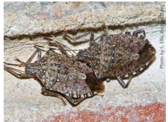
Brown marmorated stink bug adults on a house.