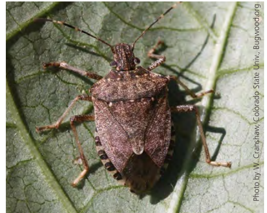
Brown marmorated stink bug adult..

Although the BMSB is not a threat to human health, people become alarmed at the large numbers that invade their homes (and even hotel rooms). This insect cannot reproduce indoors, cause structural damage, or bite. They can produce unpleasant odors in large numbers.