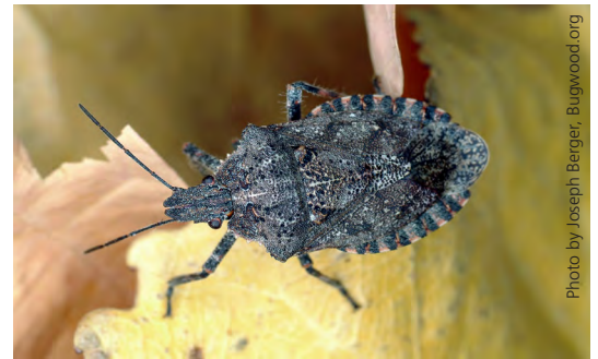
Four-humped stink bug, Brochymena quadripustulata .