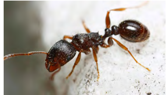
Pavement Ant, Tetramorium caespitum , adult worker.

Worker pavement ants are small insects that measure only 3mm in length. They are dark brown to black in color with a shiny abdomen. Under magnification, these ants have distinguishing grooves on their head and the dorsal surface of their thorax. Foraging ants are observed on the floor, along the edge of the walls near doorframes or on countertops where spilled food can be found. On warmer days, a number of winged male and female ants may swarm indoors and can be seen near windows attempting to escape. Pavement ants excavate soil when making their nest entrance, leaving characteristic mounds of soil. These can be observed indoors at cracks in a slab, at the junction between the wall and floor, or outdoors in the soil.