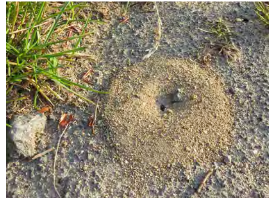
Pavement ant mound.