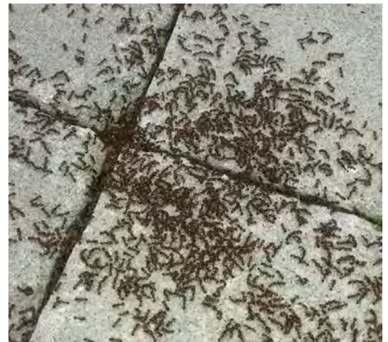
Battling pavement ant colonies can be observed on sidewalks and patios in the spring.