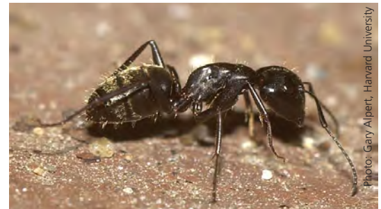
Black Carpenter Ant, Camponotus pennsylvanicus

Carpenter ant workers can be found on the floor, on counters and shelves when foraging for food inside homes. On warm days, winged ants may swarm indoors and can be observed near a window attempting to escape towards the light. Termites also swarm indoors, but can be differentiated from ants because termites tend to lose their wings and leave behind a pile of silvery flakes. Ants also have bent antennae and three distinct body parts, whereas termites have straight antennae and two apparent body parts.