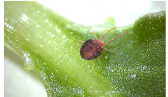
Clover Mite on garden impatiens.

After eggs hatch, the newly emerged immature clover mites move to feed on plant juices, molt, and pass through two nymphal stages. Approximately one month is needed to complete one generation