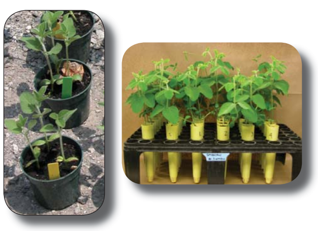
Fig. 1. Examples of soybean bioassay plants grown and maintained by a grower outside an onion storage facility (left) and in cone tubes in a research greenhouse (right).

Bioassaying your soil using soybean to detect rootlesion nematode infestation levels is only as accurate as the thoroughness of the sampling procedure and the number of composite soil samples collected. Therefore, the more soil samples collected per field the greater the understanding of the root-lesion nematode distribution within the field and the accuracy of the infestation level. The bioassay is an additional tool for managing the root-lesion nematode on an as-needed basis and it will contribute to reducing nematode damage and ultimately increasing profitability.