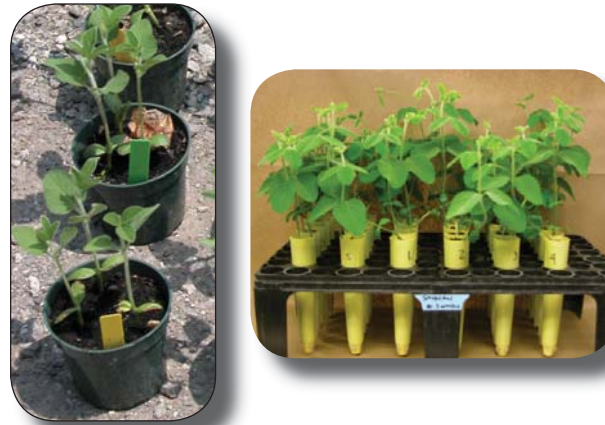
Fig. 1. Examples of soybean bioassay plants grown and maintained by a grower outside an onion storage facility (left) and in cone tubes in a research greenhouse (right).

Bioassaying your soil using soybean to detect root-lesion nematode infestation levels is only as accurate as the thoroughness of the sampling procedure and the number of composite soil samples collected. Therefore, the more soil samples collected per field the greater the understanding of the root-lesion nematode distribution within the field and the accuracy of the infestation level. The bioassay is an additional tool for managing the root-lesion nematode on an as-needed basis and it will contribute to reducing nematode damage and ultimately increasing profitability.