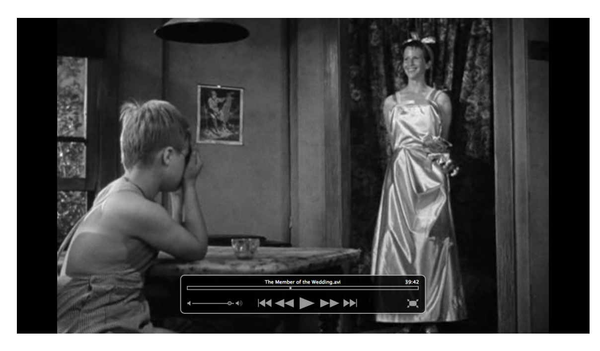
Still Image #2 (A Member of the Wedding):