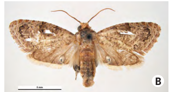
Preserved adult female (A) and male (B) moth specimens, note the question-mark-shaped marking on end of each forewing.