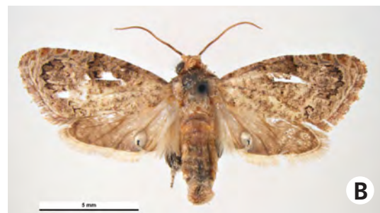
Preserved adult female (A) and male (B) moth specimens, note the question-mark-shaped marking on end of each forewing.