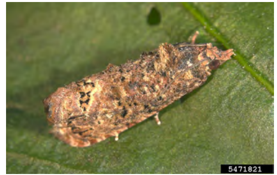
Moth at rest on a leaf.

False Codling Moth FAQs. USDA, Animal and Plant Health Inspection Service. http://www.hungrypests.com/faqs/false-codling-moth.php