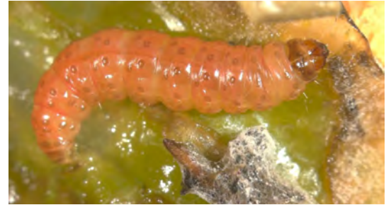
Mature caterpillar showing pinkish coloration and dots.