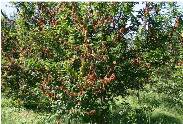
Figure 1. Blueberry plant with 50% of branches infected with Phomopsis canker.

Samples were kept on ice in a cooler and brought back to the lab. A total of 150 twig and branch samples were incubated in moist chambers and the resulting fungal fruiting bodies were