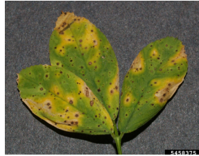
Leptosphaerulina leaf blight.

Small, light brown raised dots (apothecia) on upper surface of leaves are fruiting structures. Over time, infected leaves turn yellow and drop.