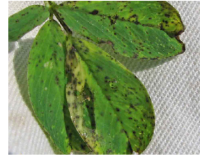
Spring Black Stem.