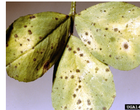
Common Leaf Spot.