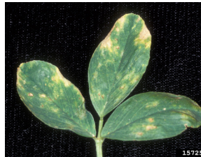
Downy Mildew.