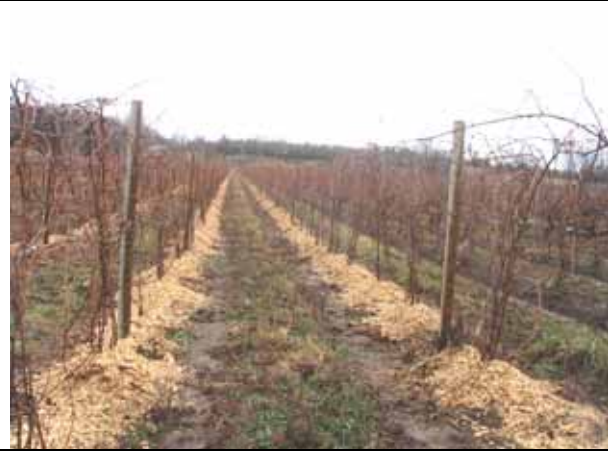
Fresh Wood chips