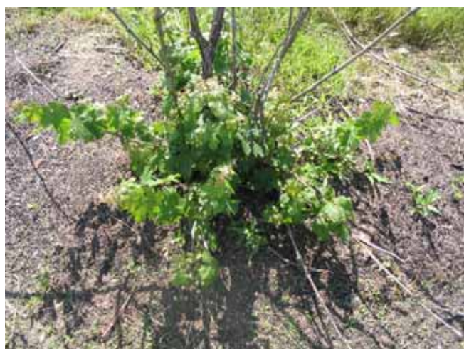
Regrowth following pomace for graft protection 2004

At two Cayuga Lake vineyards (Swedish Hill and Buttonwood Creek), materials were applied by hand. Swedish Hill has covered about 4 acres of vinifera with aged pomace for several years, while Buttonwood Creek owner Ken Riemer has materials available through his Trumansburg-based landscaping and garden store business. Applying mulch or composted pomace involved 3 workers (1 on tractor, 2 behind wagon shoveling material on to vines) for about 1 day per acre. It provided excellent protection to the graft union (see picture from 2004 below).