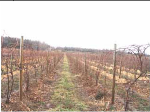
Aged wood chips