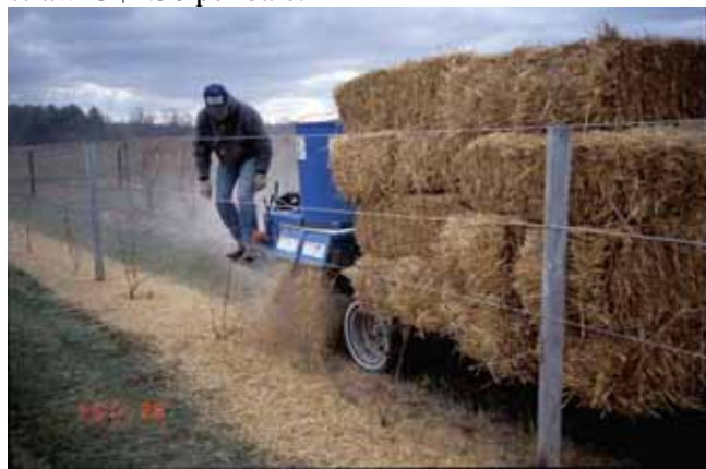
Applying chopped straw mulch at a farm in Michigan.

Straw mulch under rows. At the convention last March, Tom Zabadal described application of straw mulch, both to cover graft unions and also to insulate canes that are laid down on the ground for the winter. A few Finger Lakes growers are trying it this year. He reported using 125 small square bales per acre, with total costs per acre (including laying down canes, labor, twine for ‘tucking’ canes) of about $590 per acre (not counting cost of straw) or $943 per acre with straw @$2.50 per bale.