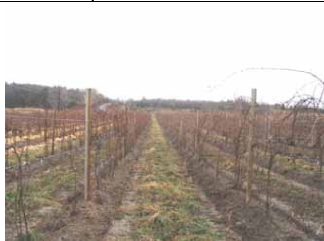
Hilled up conventionally