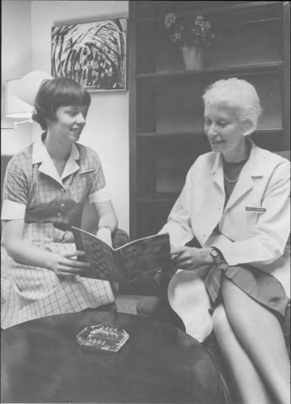
Students have the opportunity to work with the Director of Student Relations to plan social activities both at the School and in New York City.