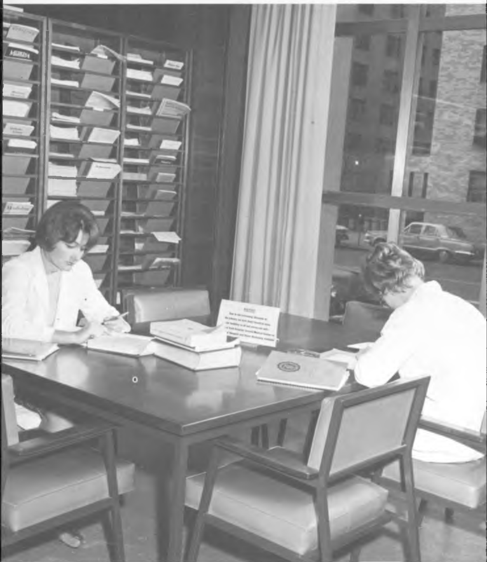
Students and faculty of both the Nursing School and the Medical College share the facilities of the Samuel J. Wood Library.