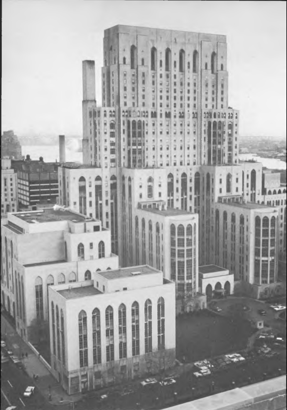
The New York Hospital-Cornell Medical Center, at 68th Street and the East River, covers three city blocks (68th to 71st Streets) and includes The New York Hospital, the Cornell Medical College, and the Cornell University-New York Hospital School of Nursing.