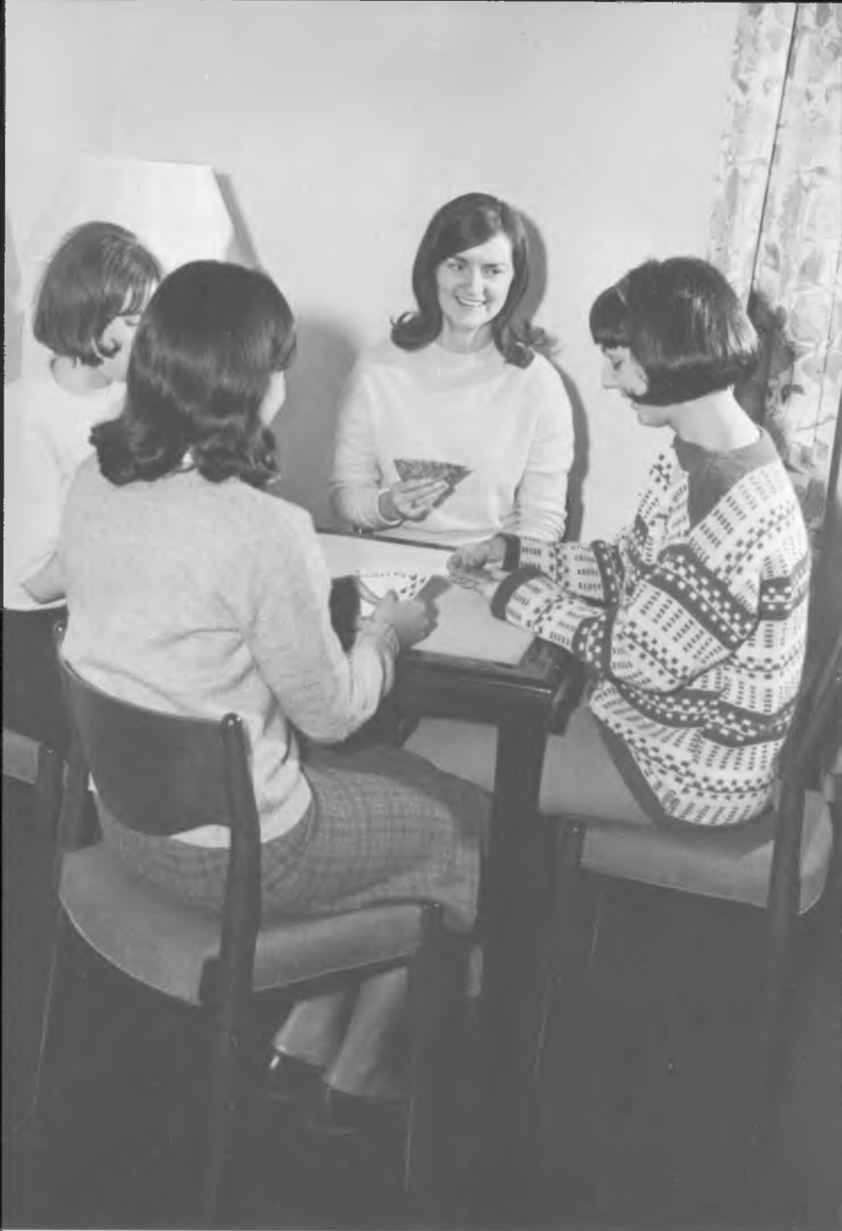
Students join in small groups to enjoy the facilities of the Residence.