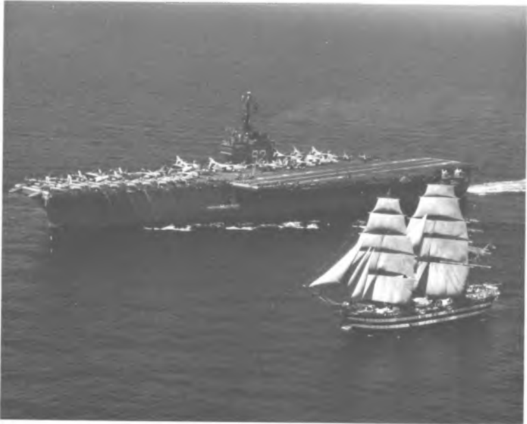
The new and the old.