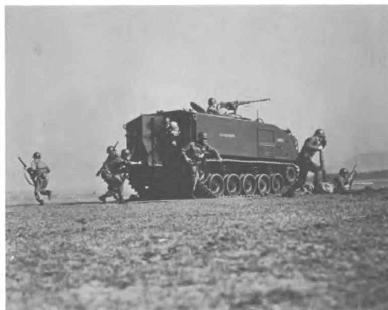
Cadets dismount from an armored personnel carrier during a tactical exercise.