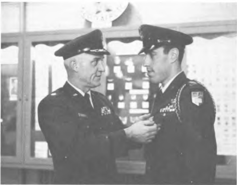
Presentation of the Distinguished Air Force ROTC Cadet badge.