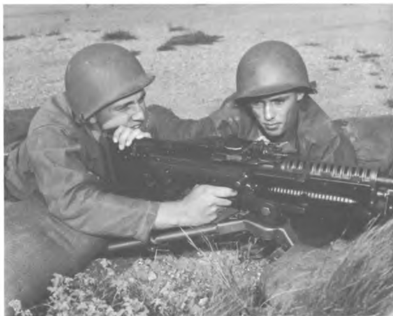
Weapons training with the Army's new M60 machine gun.