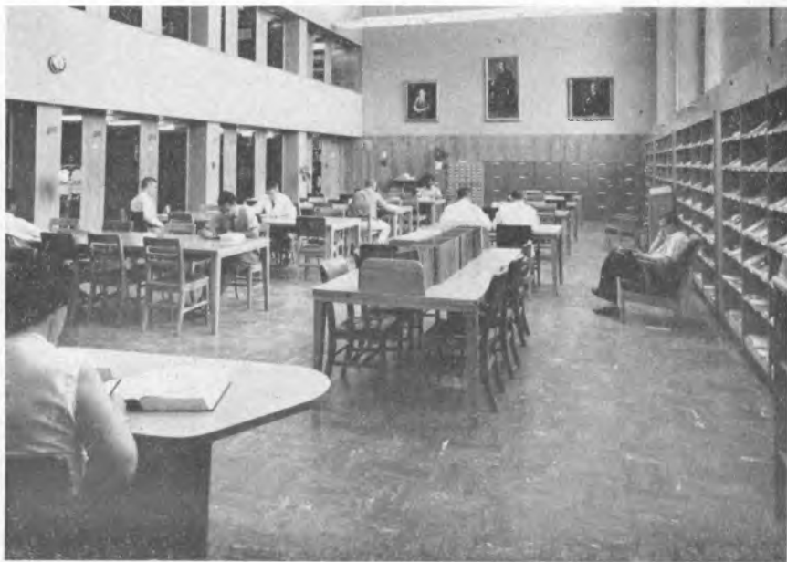
The Veterinary College Library.