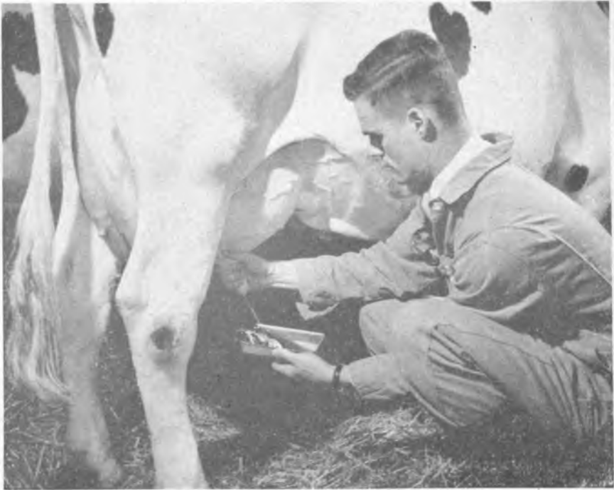
A student examines a cow for mastitis.