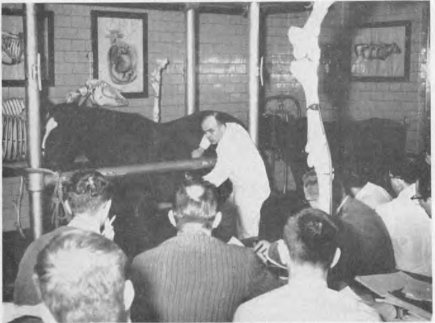
A class in veterinary anatomy.