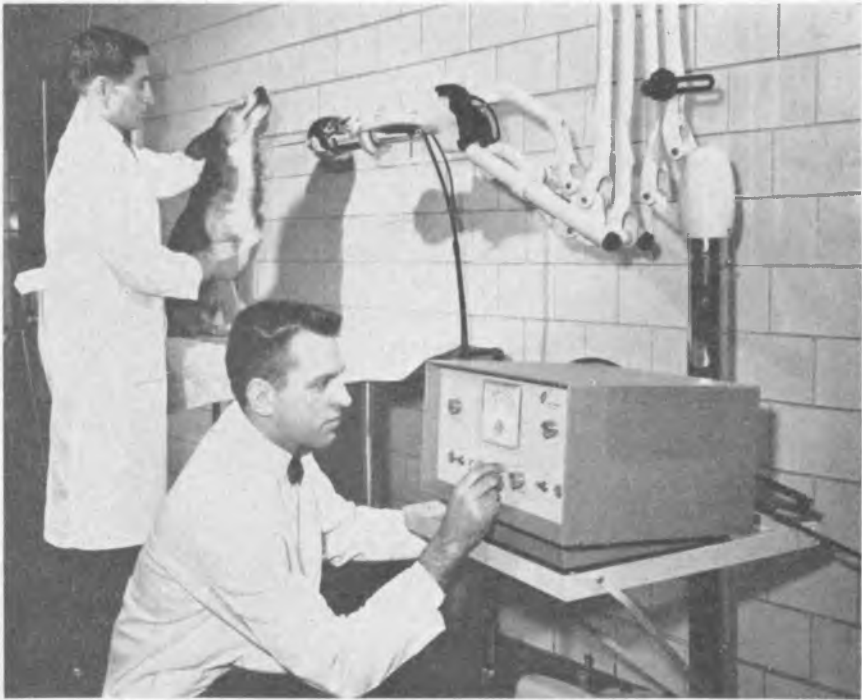
An examination for thyroid function with radioactive iodine.

THE FUNCTION of the Veterinary College is to educate young men and women to become practitioners, teachers, and research workers in the science and art of veterinary medicine. The College thus serves to protect the health of livestock, poultry, and companion animals, and to support public health programs.