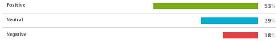
Chinese Dream - Basic Sentiment v2 — Opinion Analysis from 11/29/12 to 5/14/13 🌸

With the American economy in recession, inequality worsening, and Congress locked into ever uglier political wrangling, many Americans are losing faith in the American Dream. According to various polls, like the Chinese, only about half of Americans now believe in the American Dream. 19 One recent poll conducted by the Pew Economic Mobility Project showed that only 39% of Americans who are NOT unemployed believe they will achieve the American Dream in their lifetimes. 20 These days, in America, the phrase is just as likely to be used in irony as in earnest.