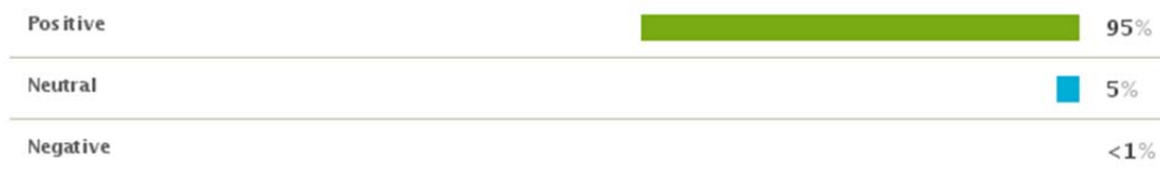
American Dream - Basic Sentiment — Opinion Analysis from 11/29/12 to 5/14/13 🌸

But it appears that national dreams only lose their luster up close. While both Chinese and Americans are split on their own countries National Dreams, perhaps reflecting a deep cynicism or disillusionment with each country’s current state, our analysis also showed that the Chinese people have overwhelmingly positive associations with the American Dream over the same span of time, though the number of mentions is far fewer.