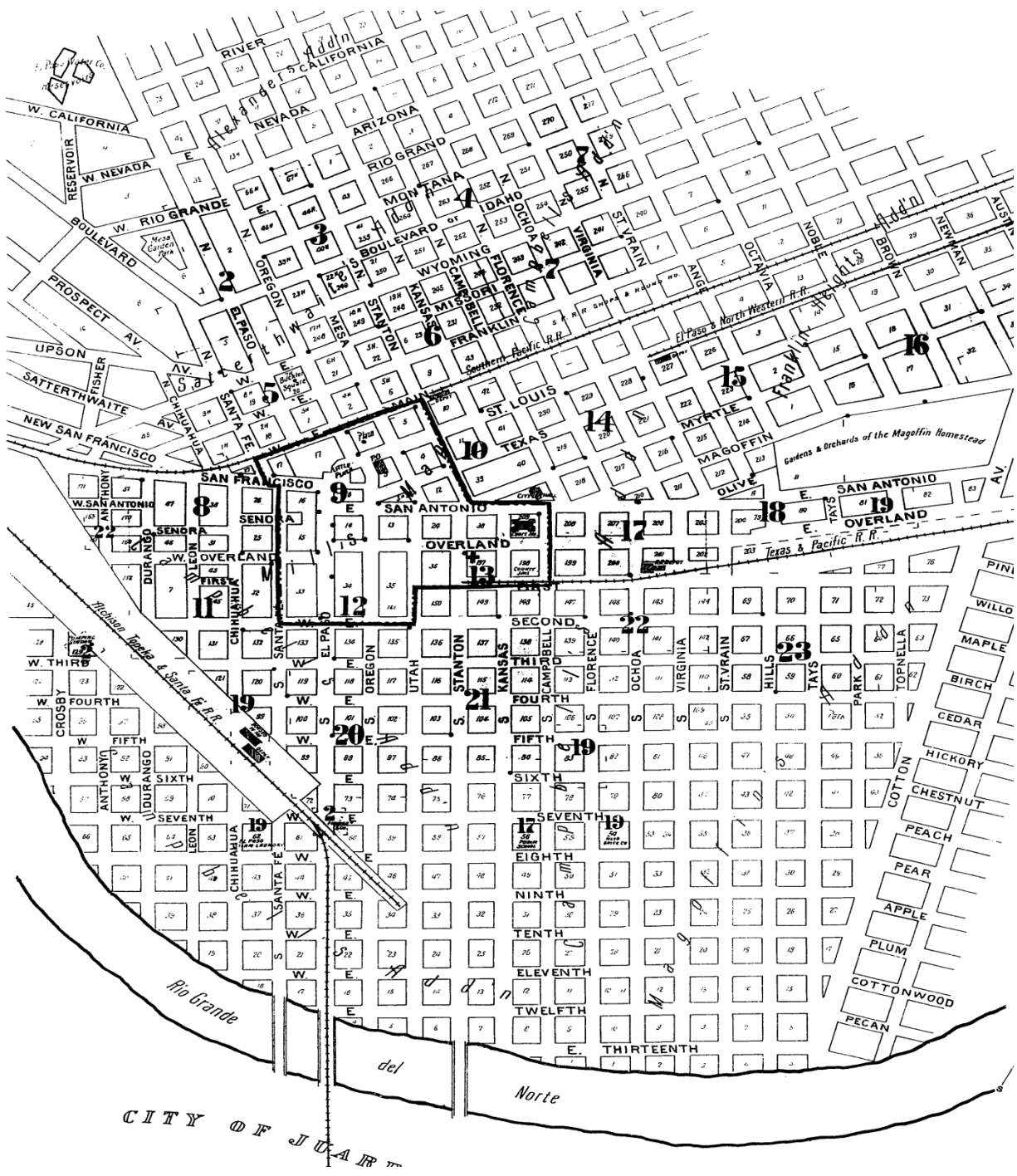
Figure 2.2. Map of El Paso in 1900.