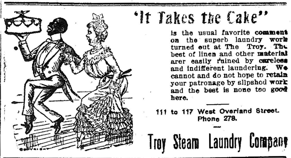
Figure 2.1. Images such as this advertisement reproduced the Jim Crow sentimentality of other Southern communities. His outfit, dark skin, accentuated lips, and somewhat feminine gait re-emphasized the subservient role of the African American figure to El Paso's white society, represented here by the white woman. At the same time, the ad suggests that African Americans enjoyed a position of "belonging" alongside whites, in contrast to the Chinese who controlled much of the laundering business in El Paso and who were the likely targets of the ad's complaint of "careless and indifferent laundering" and "slipshod work."