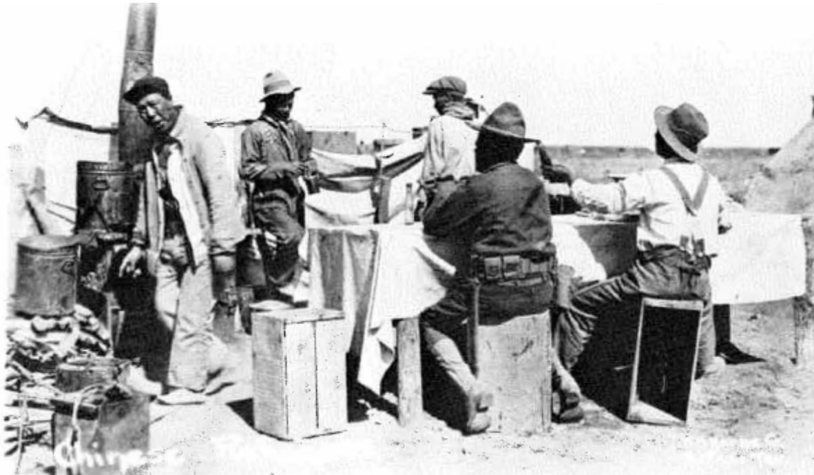
Figure 4.3. “Chinese refugees.”