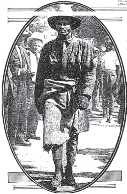
Figure 4.2. The caption underneath read: “Captive negro trooper arriving in a blanket, his trousers having disappeared in the Carrizal fight.”

Americans regarded black soldiers even as they celebrated them, complicating the claims to equal standing and citizenship that African American soldiers demanded through their military service.