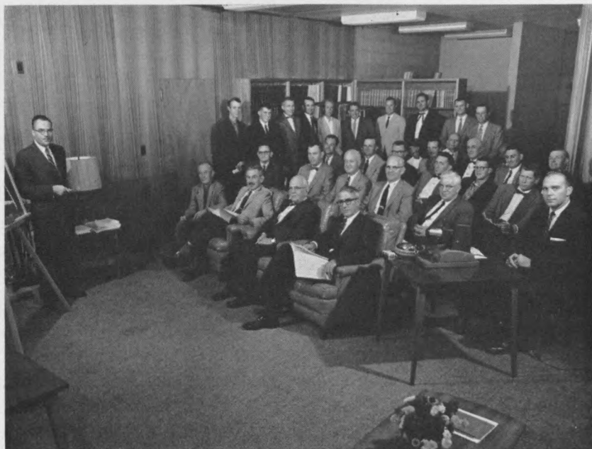
Scientists attend meeting in Seminar Room.