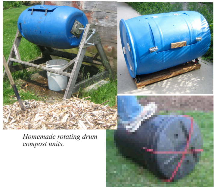
Homemade rotating drum compost units.