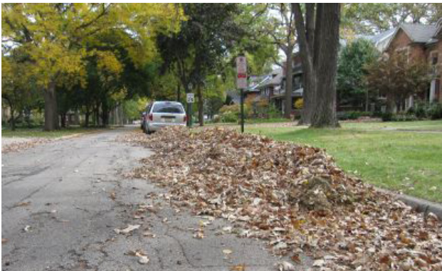
Loose leaves curbside .