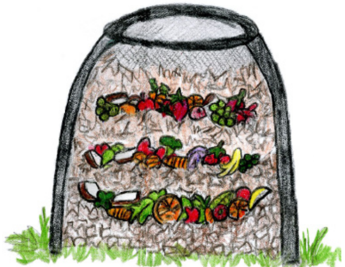
Cross-section of layered browns and greens.

Layering and choosing the right organic material creates the right environment for compost to “happen”. Start with a layer of coarse “browns” in contact with the soil. Make a well or depression in this layer and put the “greens” into the well. Keep the food scraps away from the outside edges of the pile (only brown material should be visible). Cover your “greens” with a generous layer of “browns” so that no food is showing. This will keep insect and animal pests out of the pile and filter any odor. Keep adding layers of greens and browns (like making lasagna). Keep layering the feedstock until the mass reaches a height of 3 to