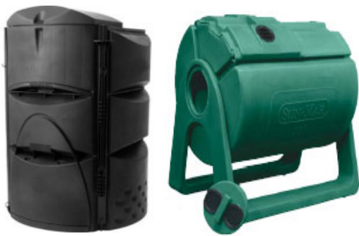
Manufactured continuous feed compost units.

◆ Continuous Feed Compost Units: These composters are designed to be fed daily. Feedstocks go in one end and compost comes out the other. These include rotating drum and bin composters that are designed specially to push waste through the system, and also include indoor, electric composters.