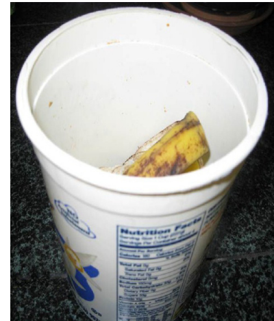
Recycled kitchen container.