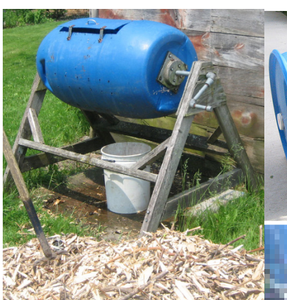
Homemade rotating drum compost units.