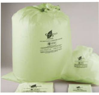
These bags tend to be Compostable plastic bags. more expensive than the petroleum-based bags but may save in labor.

• Compostable plastic bags: These bags are designed to be incorporated into compost windrows with the yard waste and no debagging should be necessary. These bags tend to be