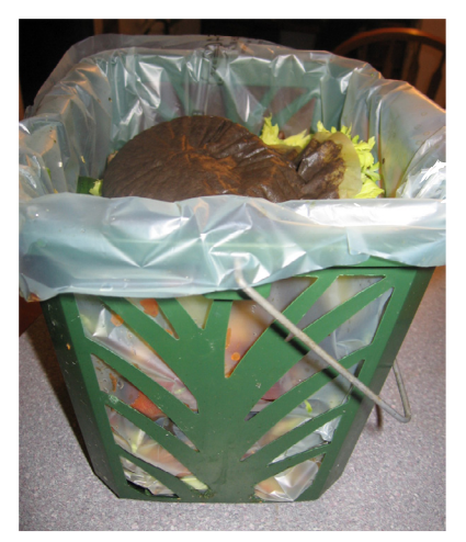
Kitchen container with compostable bag.

There are several kitchen collection containers on the market, but you can also use a recycled container or pail with or without a lid. Containers should allow air to flow through your scraps so that they will not smell before incorporation into the compost bin. Placing your food scraps in layers with crumpled newspaper can also help with odor by absorbing some of the moisture in the food. Some manufactured kitchen collection containers include a charcoal filter or have holes in the bucket to help with potential odors. Some require the use of liners (paper or compostable bags) to hold the scraps inside the bucket. As with fresh fruit sitting on your counter, collection containers may attract fruit flies in warm weather.