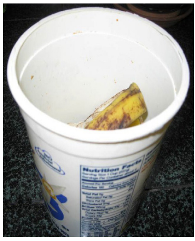
Recycled kitchen container.