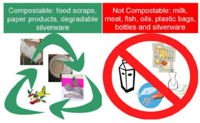
Example signage for home separation.

Any food preparation or post plate material, spoiled food, napkins, and degradable serviceware can be composted. Milk and meat products are not generally added to home compost piles, but can be composted by municipalities collecting organics because they compost greater volumes of residuals and reach proper temperatures. Signage can help while learning what to put into the containers and where many people use a shared kitchen.