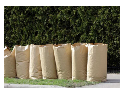
Paper leaf bags.

• Paper bags: Paper leaf bags can be a good choice since they have a base that allows them to stand up while loading, and can be incorporated into the compost along with the leaves which avoids the debagging process. However, they can be more expensive to purchase.