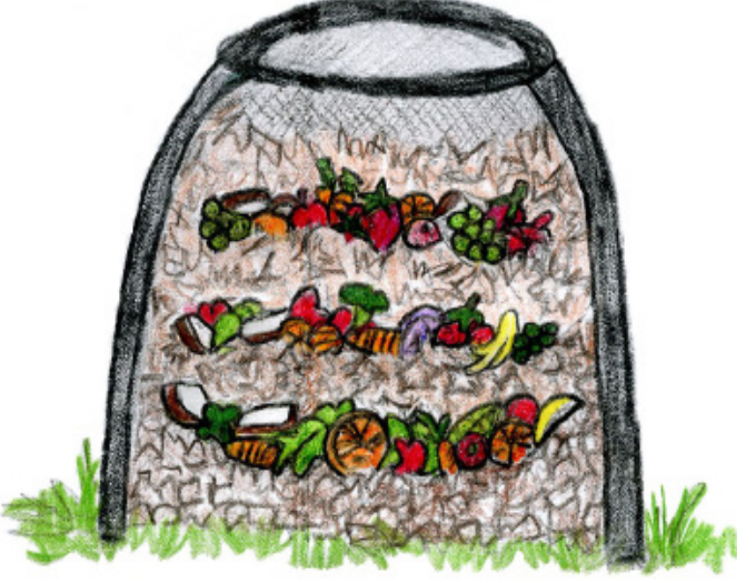
Cross-section of layered browns and greens.

Layering and choosing the right organic material creates the right environment for compost to "happen". Start with a layer of coarse "browns" in contact with the soil. Make a well or depression in this layer and put the "greens" into the well. Keep the food scraps away from the outside edges of the pile (only brown material should be visible). Cover your "greens" with a generous layer of "browns" so that no food is showing. This will keep insect and animal pests out of the pile and filter any odor. Keep adding layers of greens and browns (like making lasagna). Keep layering the feedstock until the mass reaches a height of 3 to