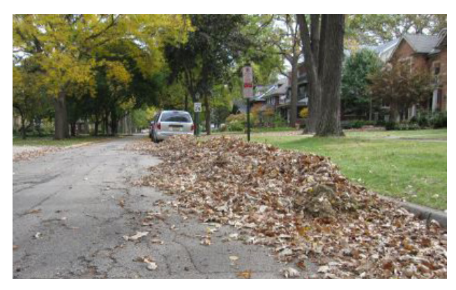
Loose leaves curbside .

• No containment: Just rake them to the curb! Some municipalities may want leaf and yard waste to be left at curbside with no containment at all. This generally has to do with the type of collection equipment they use.