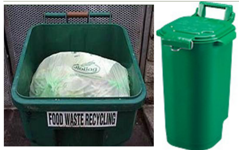
Reusable curbside collection containers.

• Reusable containers: These are generally made of durable plastic or metal with a large capacity and are intended to be used for mixed organics. Feedstock should always be layered in these containers, otherwise you will have a smelly mess and the container will need frequent cleaning.