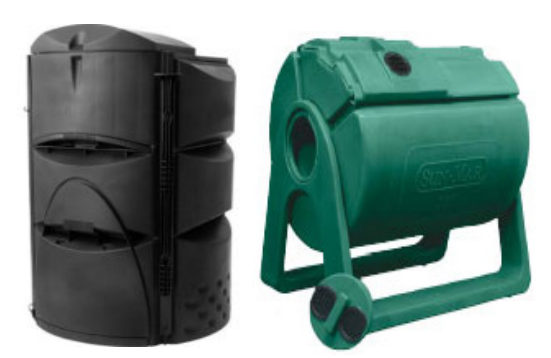
Manufactured continuous feed compost units.

• Continuous Feed Compost Units: These composters are designed to be fed daily. Feedstocks go in one end and compost comes out the other. These include rotating drum and bin composters that are designed specially to push waste through the system, and also include indoor, electric composters.