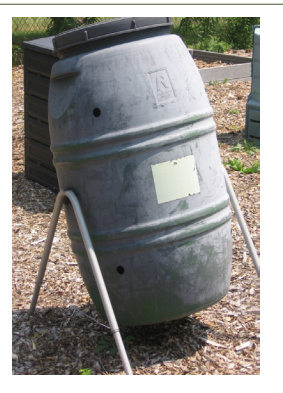
Manufactured rotating drum compost units.

• Rotating Drum Compost Units: These units are off the ground on stands or bases. They are turned either with a handle or by pushing the drum. Most drums are batch compost units in which you add feedstocks as they are generated, but with each green addition, the process is interrupted, lengthening the composting time. For best results, the drum should be full to create a batch; compost activity occurs while you are filling but conditions are not optimal until it is full. To improve processing, 2 drums can be used consecutively, or a holding bin and drum can complement each other. Some are designed with side-by-side drums for this purpose. Once the drum is full, turn it as directed to mix the feedstocks until you have a finished product.