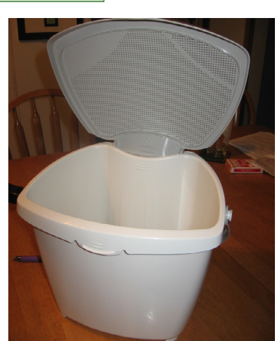
Kitchen container with locking lid and aeration holes.