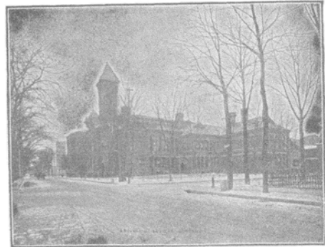
Ithaca High School.