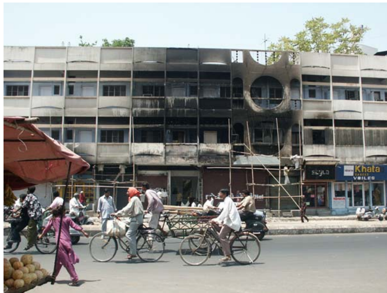
Figure 26. Surgical strikes. A pharmacy opposite VS hospital (Vadilal Sarabhai Hospital).