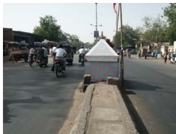
Figure 43. Street temple on road divider.