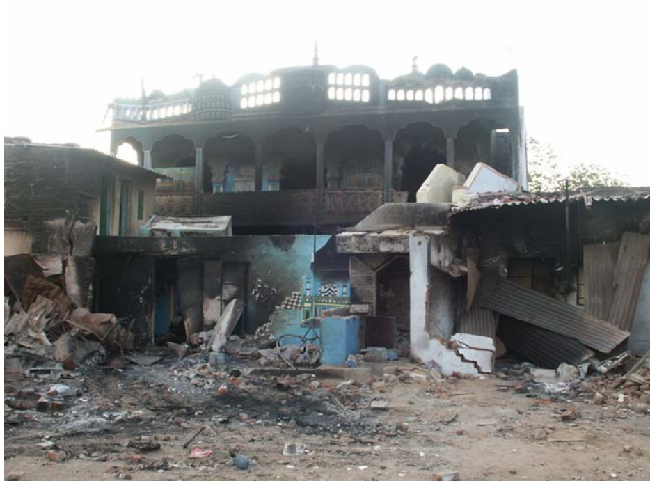
Figure 21. Destroyed Noorani Masjid at Naroda Patia, April 5, 2002.

camera of the cameraman points at them. They sit in front of the only shop that was obviously not attacked. Lalo tells me that when the pit (crowd) came they were in safety, not sitting there in front of their shop on Naroda road.