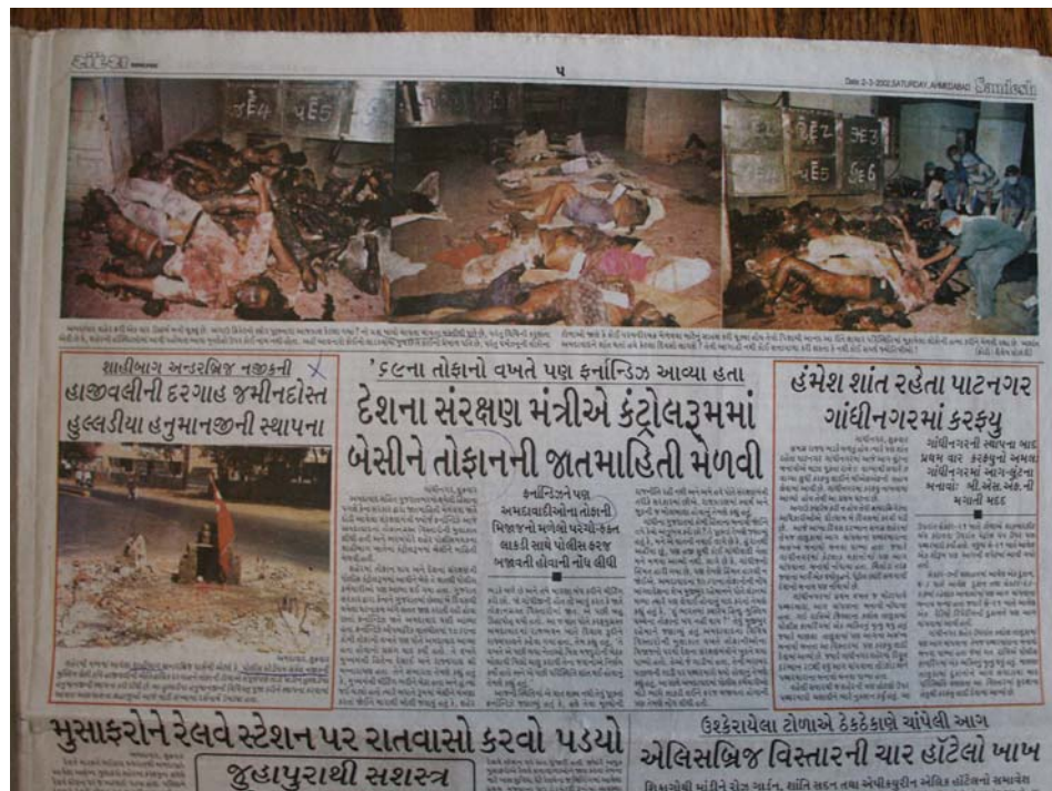
Figure A.4. Sandesh March 2, 2002, page 5. Charred remains of bodies depicted lying in a hospital. Note how the very same corpses are photographed from different angles (right and left picture respectively).