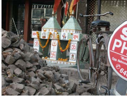
Figure 44. Street temple on sidewalk directly in front of a shop. Figures 39-44 depict mushrooming Gods in newborn temples. Note the interesting relationship to space: the structure either defines a new space, occupies existing space, or wrenches it away from where there is none left.