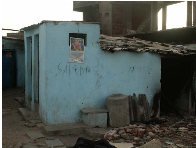
Figure 61. Incorporation of the Muslim into the Hindu. Part of a destroyed Muslim residence at Naroda Patia, a few days after the massacre. The coal scribbles say, “ Jai Shri Ram ” (Hail to God Ram) and the image of Goddess Ambaji has been attached to the wall.

Many survivors and eye-witnesses have reported that the professional killers at Naroda Patiya, Gulbarg society, Vatva, Kabadi market, Gomtipur, Behrampura, Naroda gam, Pandharvada, and elsewhere in the state, forced their victims, to utter the name of Hindu Gods before being killed. The God's name is also found written everywhere on walls and doors at sites of massacres (see Figure 61).