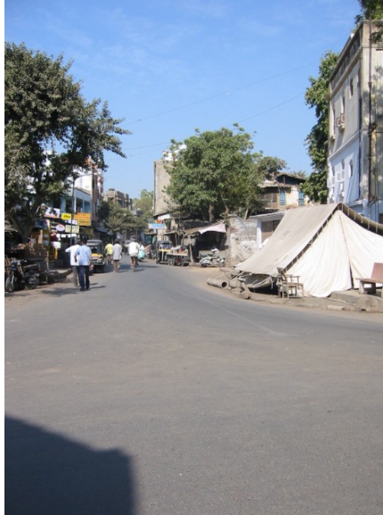
Figure 32. Police post in “border area.”

areas,” and it is those spaces, that are deemed most dangerous and prone to violence, especially during festivals, cricket games, or elections.