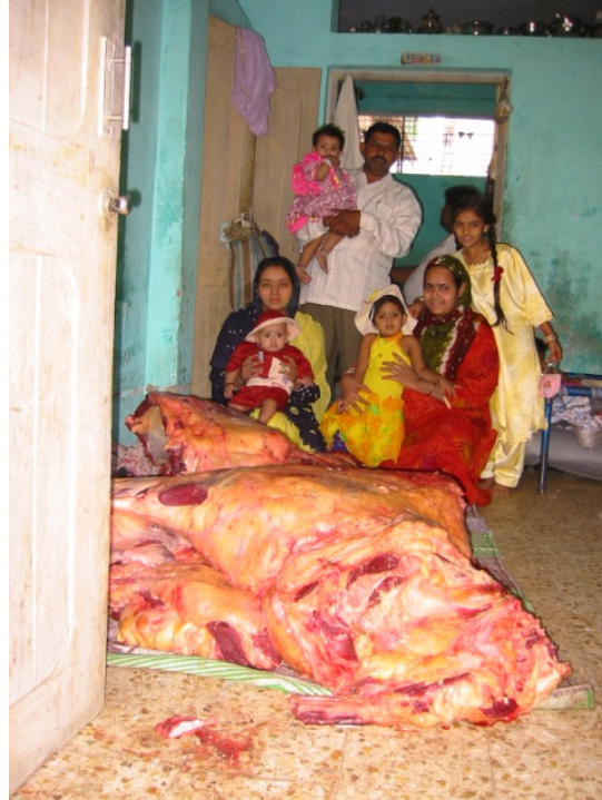
Figure 28. A Kureishi family on the festive day displaying proudly their meat.

so concerned with the visibility or invisibility of meat, where indeed the mere sight of it can make a grown man faint.