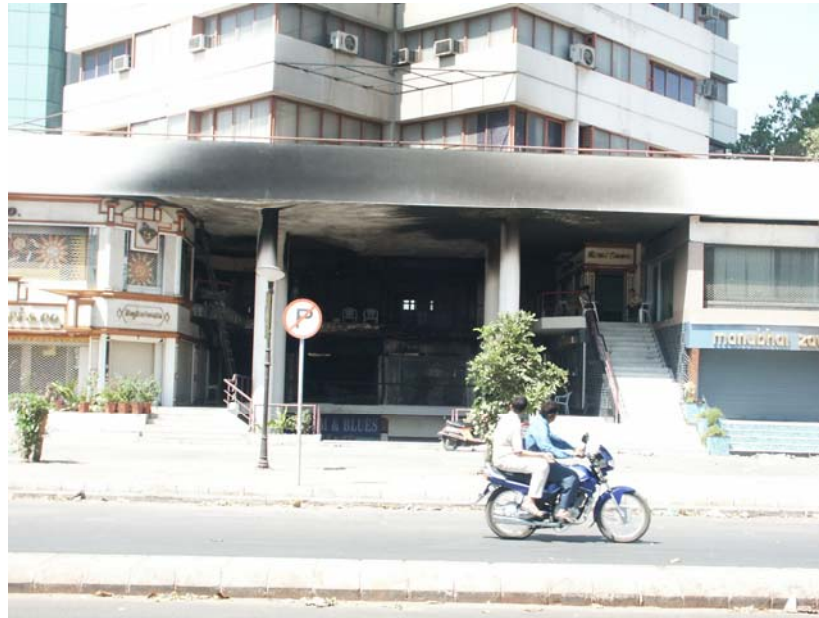
Figure 24. Charred jewelry shop becoming a spectacle on CG Road.

but very often do not include non-vegetarian items. Alternately, cosmopolitanism serves as a deceptive gloss for those who eat it but are not completely comfortable being associated with the activity in a given situation.