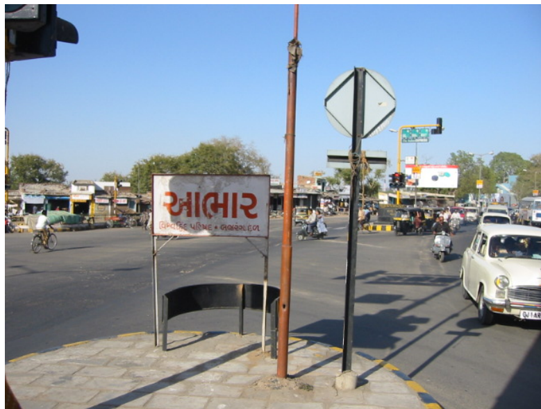
Figure 62. This board says “ Abhaar ,” which is formal Gujarati for “Thank You.” The board is signed by the Vishva Hindu Parishad (VHP) and the Bajrang Dal (BD). It appeared some time after the pogroms in 2002. Facing a poor residential ghetto (name withheld) it addresses also the traffic. The residents of the shantytown stretching beyond it partook in great numbers in the deadly first phase of pogrom violence.

The Gujarat pogrom has been termed a pre-genocidal violence. This is an apt term. Without the genuine need to eliminate all the Muslims of the state, these acts speak a warning, which Muslims can hear in every corner in Gujarat today, “You belong to us and look what we can do to you if we simply choose to...” (see Figure 62).