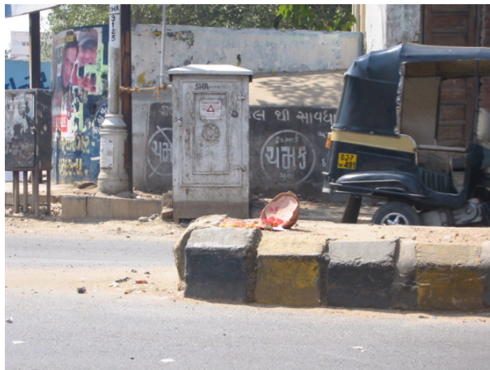
Figure 52. Utar, that which remains.