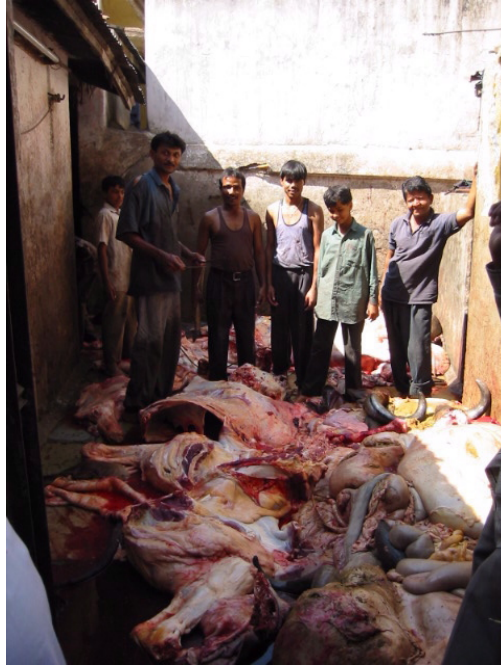
Figure 29. Bull-slaughter during Bakri-Id.

neighbors. Every year many members of the Jain community would be very upset about this.