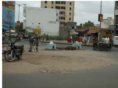
Figure 41. Small street temples grabbing land.