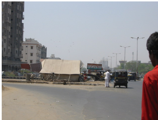
Figure 35. On the border between “Mini-Pakistan” and “Hindustan.” On the outskirts of Ahmedabad, a tambu at the entrance to the Muslim ghetto of Juhapura. In Ahmedabad, Juhapura is the quintessential “Mini-Pakistan.”