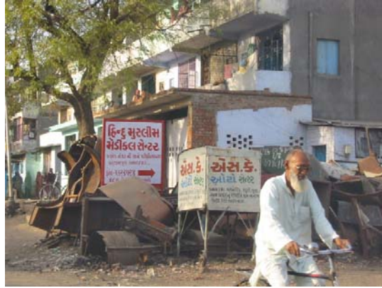
Figure 34. Entrance to a small hospital in the tense Dani Limbda area, where Hindus and Muslim live close by one another. The red board with the arrow reads “Hindu-Muslim Medical Center,” stressing the fact that both communities are welcomed to use it.