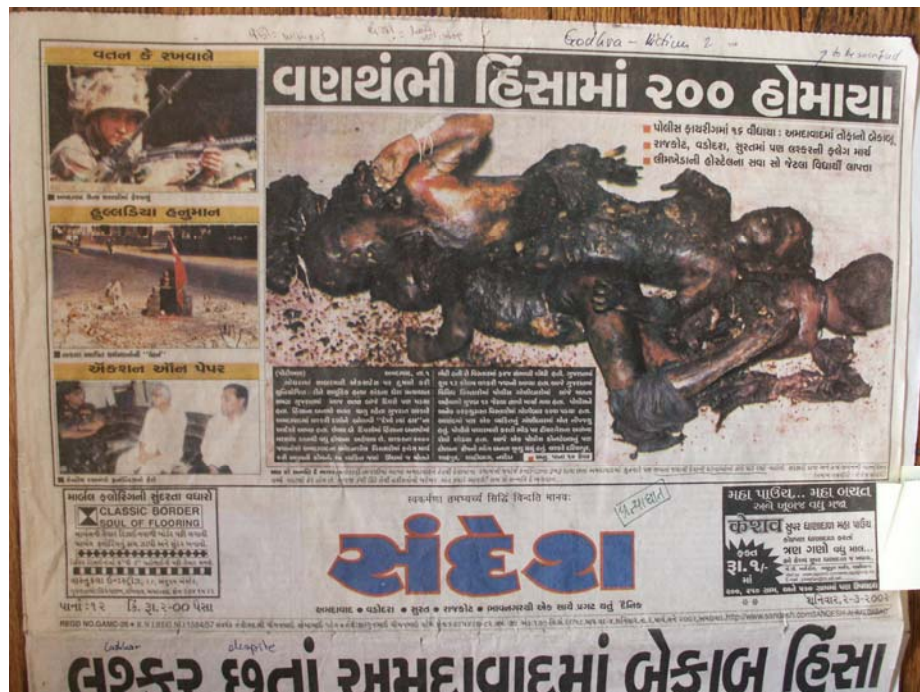
Figure A.3. Sandesh March 2, 2002, "...200 sacrificed in violence," front page. The verb used is homaayaa (offered into the fire). Identity of victims not mentioned.