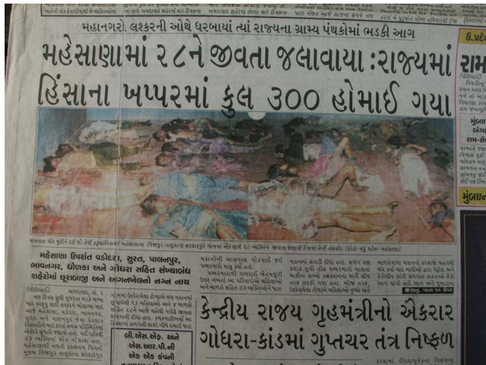
Figure A.5. Sandesh March 3, 2002, "...300 sacrificed in violence" front page. The verb used is homai gaya (sacrificed into fire). Identity of victims not mentioned.