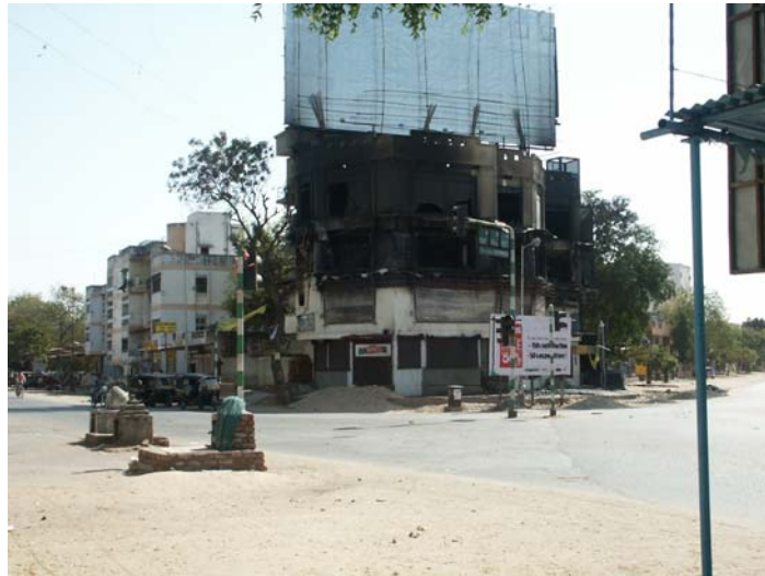
Figure 23. Burnt vegetarian Tulsi restaurant at Gulbai Tekra.