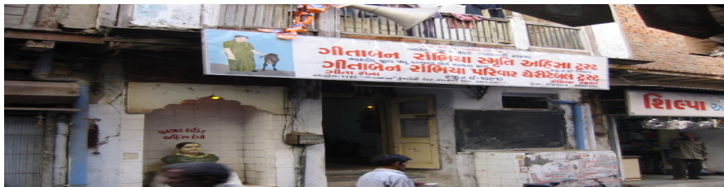
Figure 55. Gitaben Rambhiya Smurti Ahimsa Trust in old the heart of Ahmedabad.

When I ask residents about the whereabouts of the “Ahimsa Devi Trust,” they are eager to show me the way. The building in mandvi ni pol , in the heart of old Ahmedabad, is well-known. At a building with a large board announcing the trust, a woman is depicted with a green Sari petting a young calf in motherly care (see Figure 55). To the left of the entrance, there is a color painted bust of the same woman. I was told it was marble, but it is not. Above the bust of the woman in green Sari, it reads in red “Immortal Martyr, the Goddess of Non-violence” ( amar shahid ahimsa devi ) (see Figure 56).