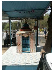
Figure 42. Adolescent street temple.