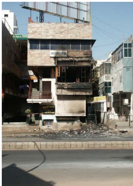
Figure 22. Destroyed vegetarian restaurant at Vijay char rasta.

Abhilasha was located just opposite of the Panjarapole animal shelter where ahimsa (non-violence) and jivdayaa (compassion for all life) is put into the concrete practice of animal care, especially care for old cattle. The shelter is financed mostly by the Jain community, but not exclusively. A large shopping complex adjacent to the animal shelter is called Kamdhenu Complex, kamdhenu being the mythical cow of plenty. It seems to be deserted most of the times.