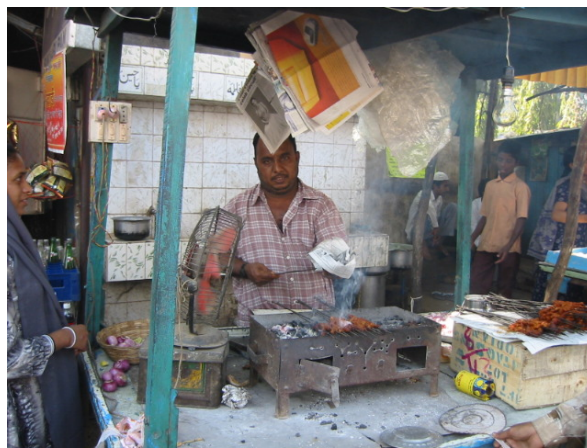
Figure 54. Muslim meat-stand in Ahmedabad.