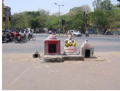
Figure 40. Cluster of small street temples.