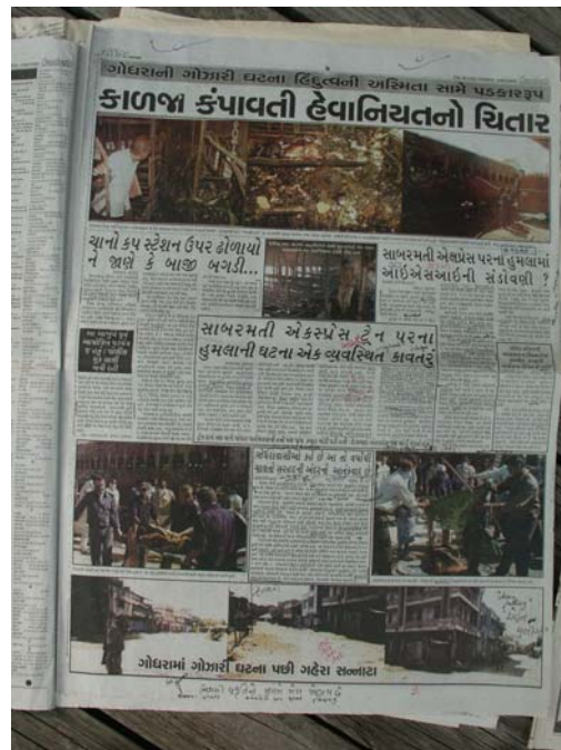
Figure A.2. Sandesh February 28, 2002, page 6. Depiction of Godhra incident. In the photography in the center, a compartment is depicted with bodily remains of victims.