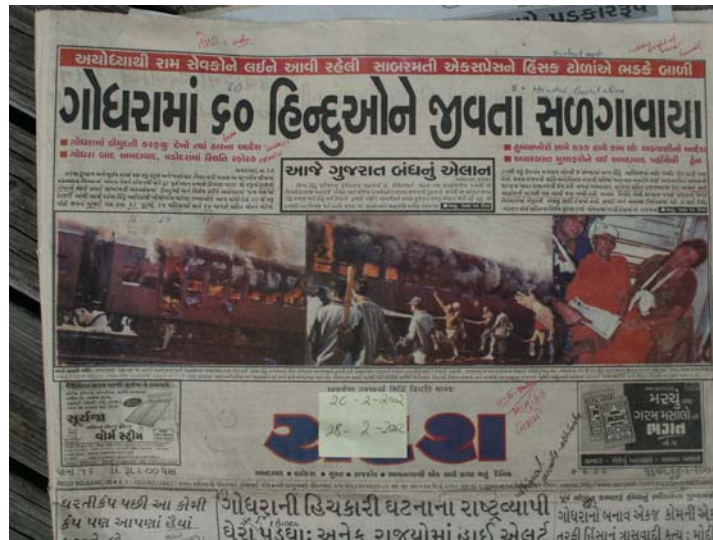
Figure A.1. Sandesh February 28, 2002, “In Godhra 60 Hindus burnt alive,” front page. Note that the victims are explicitly identified as “Hindu.”