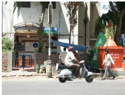
Figure 45. Two small but very successful street temples on CG road (to the right in red and green), which can claim seniority to an ATM bank machine on the left next to it, and are frequented by employees of offices, traffic police, as well as people passing-by

riders on two-wheelers greet the deities with a nod or a brief placing of a hand on the heart, risking accident, but always amazingly optimistic that nothing will harm them at that moment. Often a paan , or teashop, or both, quickly arises next to a temple. Ultimately, the religious entrepreneur seeks to become a sadhu . Then he and his followers tell elaborate stories and draw pictures of his spiritual predecessor (his Guru) and of the ancient origin of the temple, even when residents of the locality know very well that five years prior there was only a traffic island of concrete in the place where the temple now stands, where, police had smoked their bidis , wielded their laatis , and spit their paan.