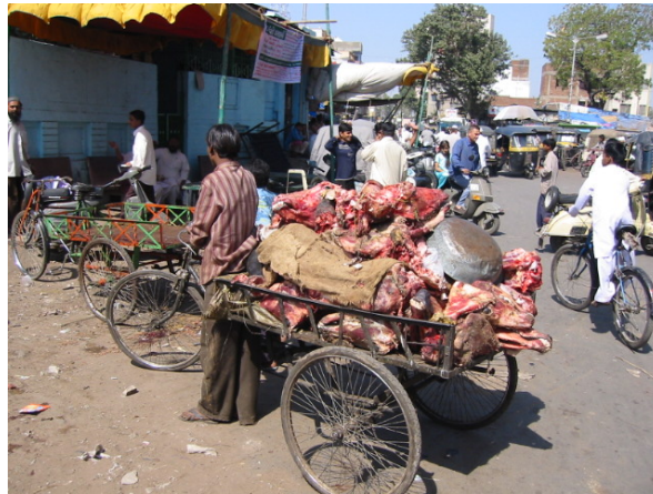
Figure 30. Meat transport by a low caste Hindu employed by Muslim butchers during Id.

I ask Sejal if she is aware of the religious background of Bakri-Id. She tells me of “this pious man” whom God asked to give something most precious and valuable to