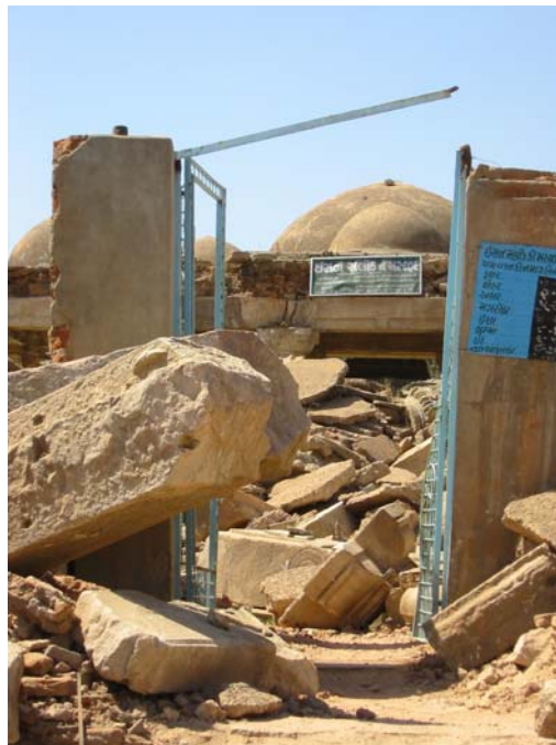
Figure 48. The remains of the attempted destruction of 16 th century Isanpur Dargah with bulldozers in Vatva in 2002.