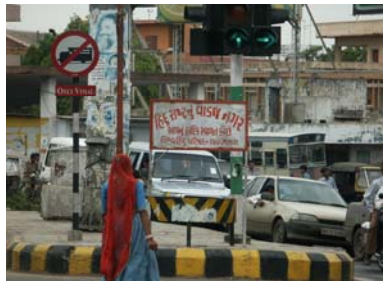
Figure 33. Marking spaces. Typical boards set up all over the city by the VHP and the BD. The boards are announcing the entry into a “ hindu raashtra .” Whereas left and right residents of specific areas are welcomed, in the center the traffic is welcomed to the Hindu Nation of “ karnavati .” “Karnavati” is the un-official “Hindu” name for Ahmedabad.

The culminating effect of this severe development can be grasped by the automatic transformation of personal conflicts into communal conflict, which makes for the contamination of violence in certain city spaces, especially in the aftermath of