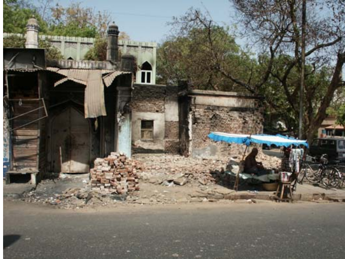
Figure 25. Destroyed Mosque, surviving shack.