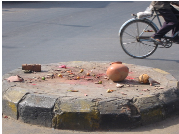
Figure 51. Magical remains on a traffic island in the city. Note the red power, coconut, and the yellow lime.