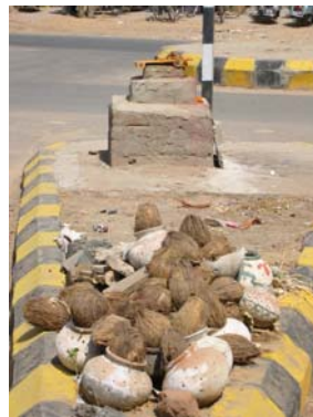
Figure 39. Small street temple on traffic island.

landscape is inundated with these bathroom-tile temples. Next to the Muslim sand stone structure of a several hundred-year-old dargah (shrine), a sea of concrete Hindu temples mushroom in bright colors of red and white. Although Ahmedabadis accept these small structures as part of the urban landscape, they sometimes comment dismissively that they are largely erected for land-grabbing purposes. People build them overnight, smack in the center of street corners, walkways, even busy intersections where they are bound to hinder traffic and become a nuisance to neighbors of whatever religion (see Figures 39 through 44). But similar to the so-called “cow menace” on the streets of Ahmedabad, a cloud of secrecy and tension prevails over the question of their emergence and status. 35