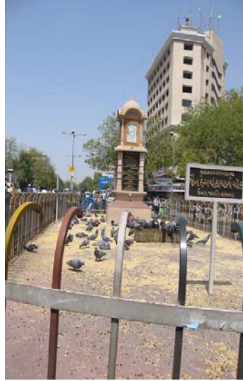
Figure 59. The resemblance to a Jain memorial.