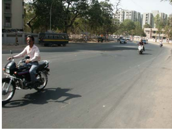
Figure 47. The disappearance of Vaji Ali Dargah in Shahibaug, which used to be in the middle of the road.