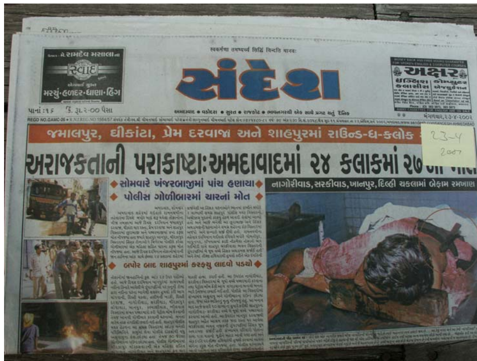
Figure A.6. Sandesh, April 23, 2002, front page.

Depiction of a stabbing incident of a victim—marked as Hindu through the red armband on his right wrist. Note how the stab victim lies on a doctor’s operation table as if on a butcher’s board, the horrific fascination expressed through the red circle around the knife stuck in his back. The red circle is to guide the viewer’s eye to the exact spot where the knife penetrates the body of the victim.