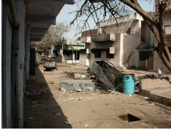
Figure 20. Inside the courtyard of Gulbarg society after the massacre.