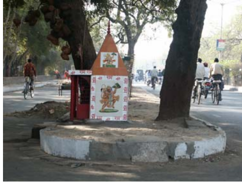
Figure 38. Small bathroom tile temple of Hanumanji.