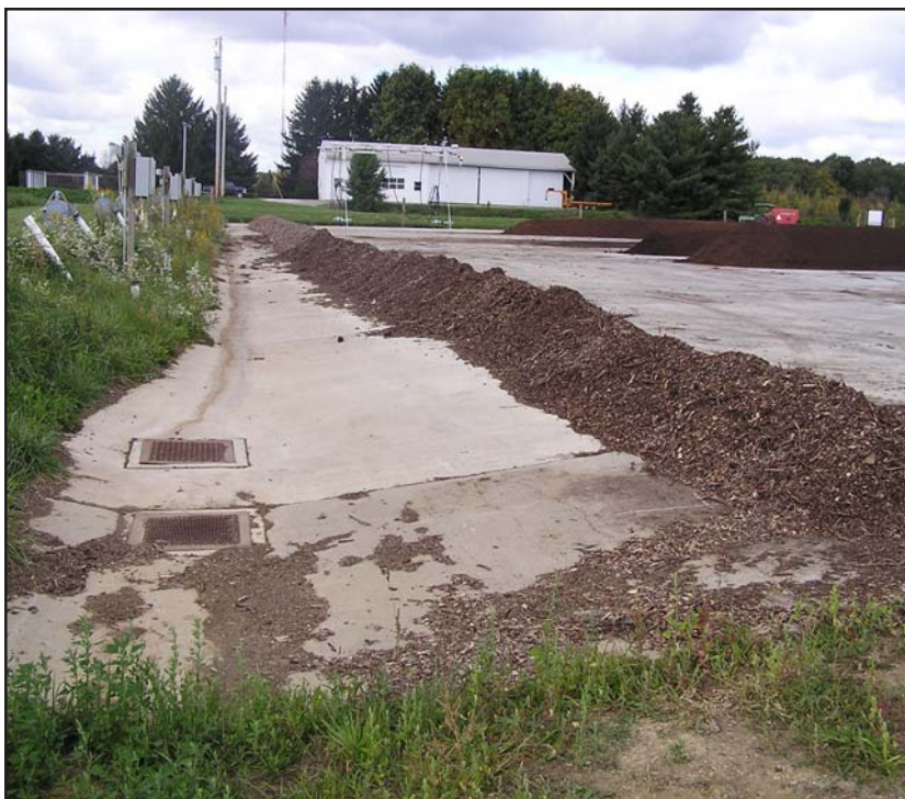
Compost berm at Ohio State composting site. Collected runoff is treated in a wetland before disposal.

Leachate, formed when water percolates through the organic material, can be harmful to ground and surface water, because it can deplete oxygen and may contain unacceptably high levels of nitrogen phosphorus or pollutants. An initial bed of carbonaceous, bulking materials underneath the compost pile can help absorb excess moisture and keep it in the windrow. If the compost site is at the bottom of a slope, berms can be built to divert runoff water around the pad.