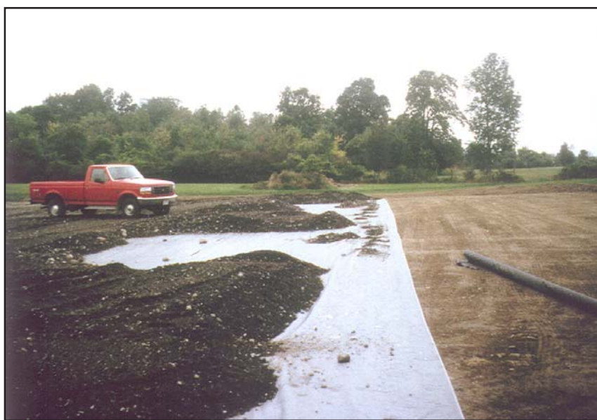
Cloth and gravel pad.