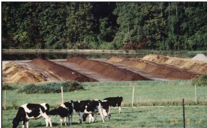
Cornell's compost site.

Good housekeeping at the site is important. There should be no ruts, standing water or garbage on the site. Site perimeters should be mowed to avoid contaminating piles with weed seed that will blow in. Good maintenance keeps the operation running smoothly.