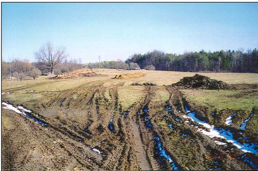
Site preparation avoids rutting.

Siting is very important to help avoid neighbor issues. Compost processing can generate odors (though these should be minimal in well-run operations), and odor is likely the main reason neighbors may complain about the operation. Determine the dominant wind direction, and if most air flow is directed toward populated areas, look for another site. In New York State, permitted compost facilities need to be at least 200 yards away from the closest dwelling. They cannot be sited in a floodplain or wetland, or where the seasonal high groundwater is less than 24 inches from the ground surface, or where bedrock lies less than 24 inches below