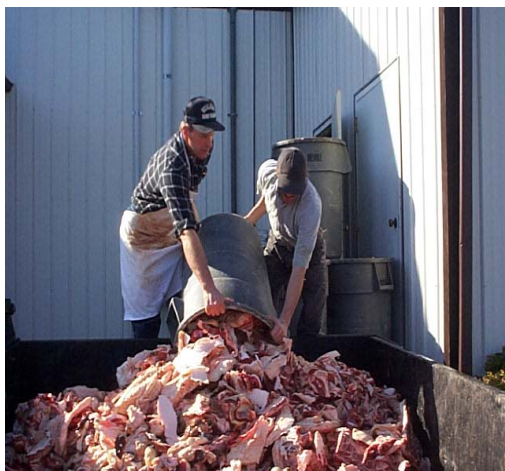
Wilson Beef Butcher Waste composting

5. Make sure all residuals are well covered to keep odors down, generate heat or keep vermin or other unwanted animals out of the windrow.