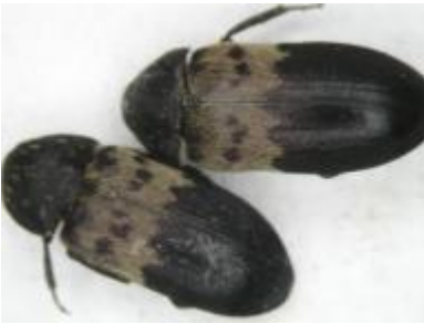
Adults (approx. 1/3 inch).