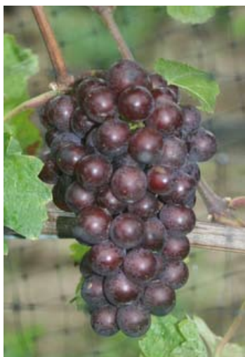
Pinot Gris in the Finger Lakes, September 12

A warmer than usual fall has advanced harvest dates in the Hudson Valley so far, with many vineyards already having picked early white hybrids. Chardonnay and Pinot Noir were picked for sparkling wine last weekend, more than two weeks earlier than last year. Some Pinot Gris and Gewurtztraminer will be harvested this coming week. The TA has been lower than normal this year for many varieties grown in the Hudson Valley. Cold nights have brought excellent color to the grapes with later reds such as Cabernet Franc, Sangiovese, Cabernet Sauvignon, and Merlot on track to mature early. Bird damage varies by vineyard according to the crop protection practices being used. Finally, powdery mildew is appearing on leaves in many vineyards.