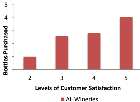
Figure 2: Number of Bottles Purchased for Each Level of Customer Satisfaction

We then conducted further statistical analysis, which allowed us conclude with certainty that a one unit increase in customer satisfaction leads to approximately one more bottle being purchased. This says that on average, increasing customers’ overall experience by 1 unit from ‘2’ to a ‘3’, or a ‘3’ to a ‘4’ or a ‘4’ to a ‘5’ increases sales by 1 bottle per customer.