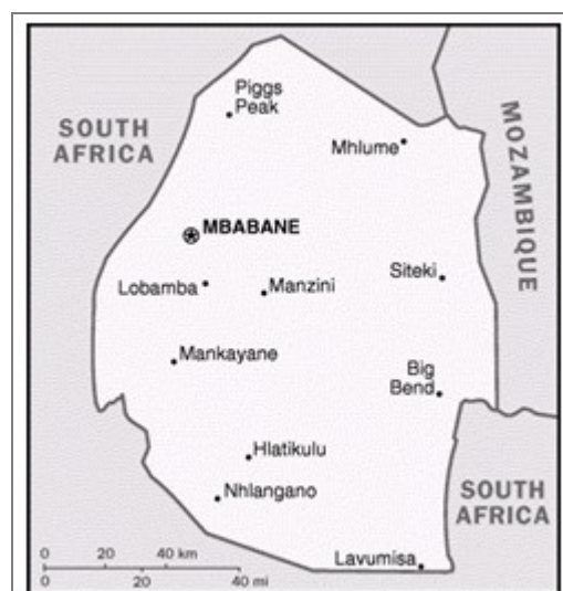
Figure 1. Location map of Swaziland

Swaziland is located between latitudes 30^{\circ} 30'E and 32^{\circ} 30'E of the Greenwich and between longitudes 25^{\circ} 30'S and 27^{\circ} 30' S of the Equator. The country is bounded in the north, west, south and south - east by the Republic of South Africa and to the north - east by the Republic of Mozambique. (Figure 1). The country covers a total area of 17,363\text{km}^2 , out of which 17,203\text{m}^2 is land and the remaining 160\text{km}^2 is water.