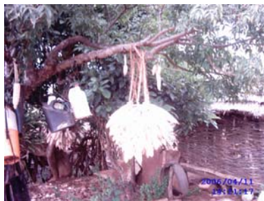
Fig.7 The use of tree branches for crop storage