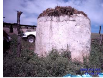
Fig.4 Concrete tank