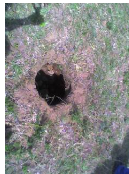
Fig. 8 Location of an abandoned underground pit

The crib is traditionally used as a drying structure and it is only on a few occasions that it is used for storage. The maize cobs, after harvesting, are left in the crib to dry for between one and three months after which they are shelled and put in the tank. For this reason, most of the cribs are constructed annually and after the maize is dried and removed, the structure is destroyed. The few that are used for storage are provided with a roof and are given minor maintenance. Fig.5. At present, the Crop Storage Unit is popularizing the improved cribs among farmers. The improved crib involves the use of durable wooden members, metal and wire mesh and is also provided with a roof made from corrugated roofing sheets. Besides drying, the structure is also being popularized for use in produce storage.