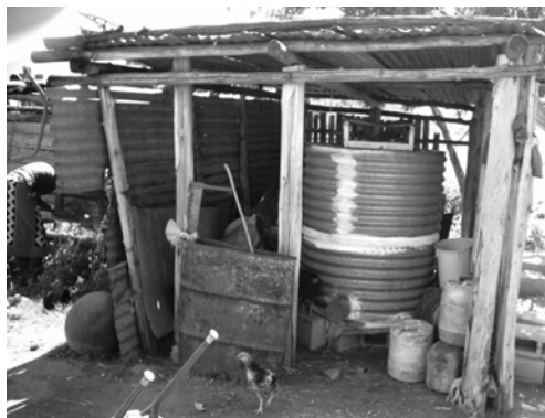
Fig. 11 Failed joint in metal tank, re-soldered and painted over as shown by the white vertical and horizontal strip. Also shown are metal drum and assorted containers which are also used for storage

The most common problem with bags was leakage which occurs when the bag gets torn and was reported by about 61.5% of the respondents. Bag tearing could be as a result of rodents that gnaw through them or during handling when the bags are pressed against sharp edges. Holes in bags are points through which produce fall out of the container and are lost. Such points are also avenues for rodents that feed and defecate on the produce reducing both the quality and quantity.