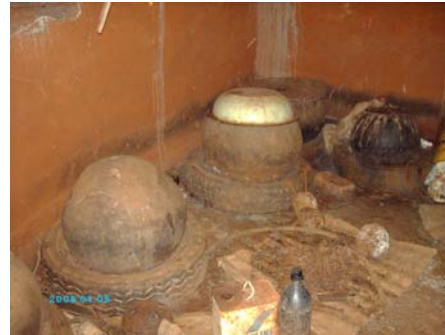
Fig. 6 Clay pots for crop storage