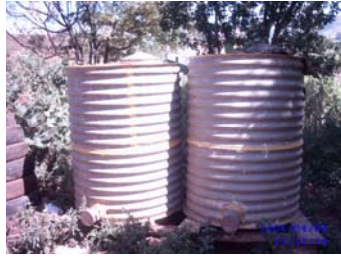
Fig.3. Metal tank for maize storage