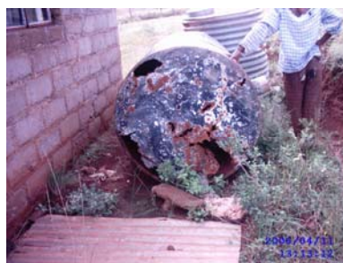
Fig.10 The corroded bottom of a maize tank, a common problem in many households.