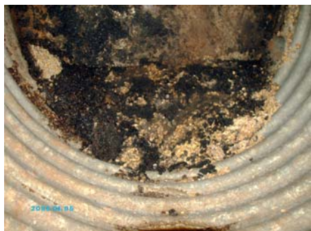
Fig. 9 Caked and moulded maize at the bottom of a metal tank

The problems experienced with the various crop storage structures and produce stored in them are presented in Tables 3 and 4, and figs. 9 and 10. These included leakages, buckling or bending/collapse, rusting, joint failure and moisture condensation, insect infestation, moulding, caking and germination.