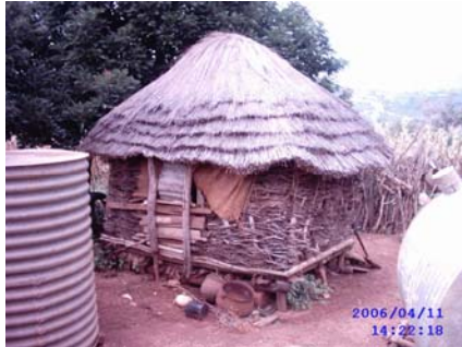
Fig. 5 Traditional crib