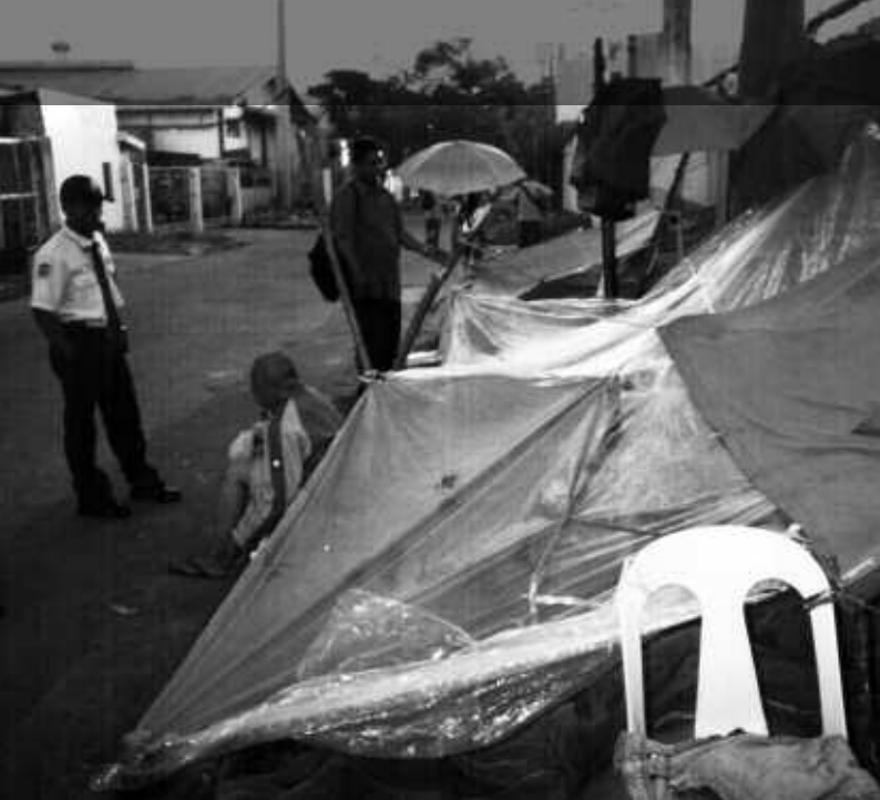
Makeshift tent housing workers striking for union rights at Wal-Mart supplier Chong Won in the Philippines.

The response of Wal-Mart Watch and Students and Scholars against Corporate Misbehavior (SACOM) was to issue another report, this one on the conditions in toy factories in China that supply Wal-Mart. China is Wal-Mart's largest sourcing country.