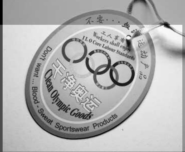
Olympic campaigning material being used by Hong Kong labour rights organisations.

The Clean Clothes Campaign (CCC) aims to improve working conditions in the garment industry worldwide and empower (women) garment workers. The CCC is made up of coalitions of consumer organisations, trade unions, researchers, solidarity groups, world shops, and other organisations. The CCC informs consumers about the conditions in which their garments and sports shoes are produced, pressures brands and retailers to take responsibility for these conditions, and demands that companies accept and implement a good code of labour standards that includes monitoring and independent verification of code compliance. The Clean Clothes Campaign cooperates with