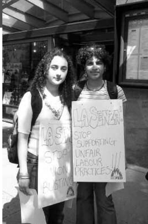
Volunteers from the Maquila Solidarity Network, a CCC ally in Canada, protesting in front of a La Senza store in Vancouver, to draw attention to problems at a supplier in Thailand.