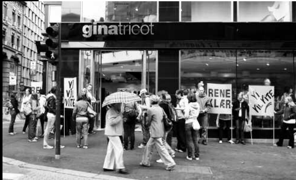
Rene klær, the Norwegian CCC, held its first leafleting action in Oslo directly after the launch of the campaign.