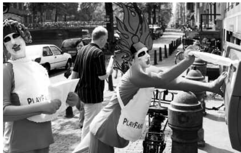
Two of the official Beijing Olympics mascots ("fuwas") were at the main post office in Amsterdam, the Netherlands to mail the PlayFair 2008 report to the Dutch members of the International Olympic Committee.